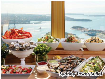
Sydney Tower Buffet