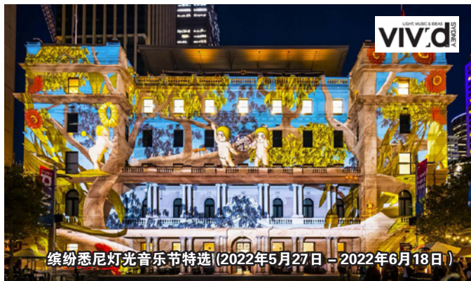
缤纷悉尼灯光音乐节特选 (2022年5月27日 - 2022年6月18日)