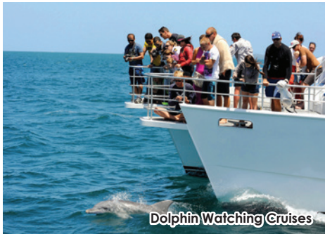
Dolphin Watching Cruises