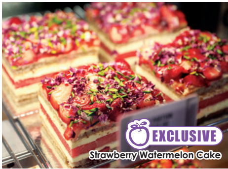
EXCLUSIVE Strawberry Watermelon Cake