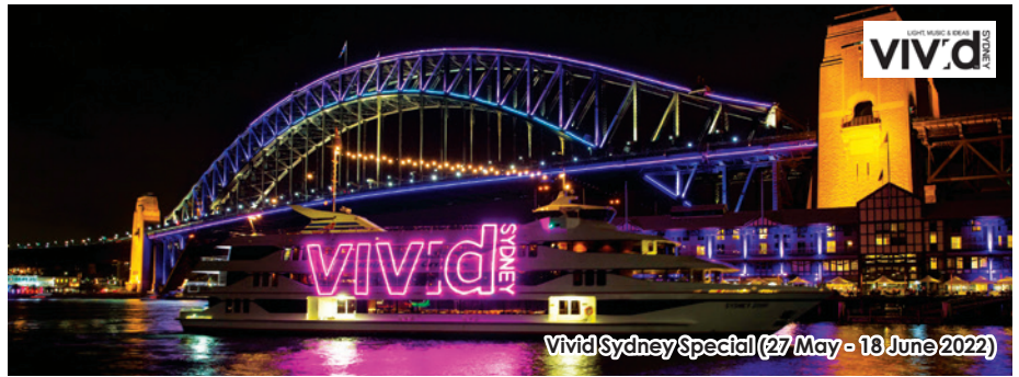
Vivid Sydney Special (27 May - 18 June 2022)