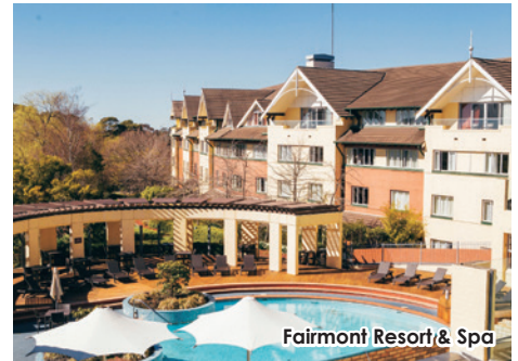
Fairmont Resort & Spa