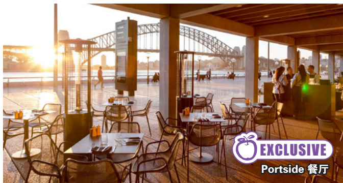
EXCLUSIVE Portside 餐厅