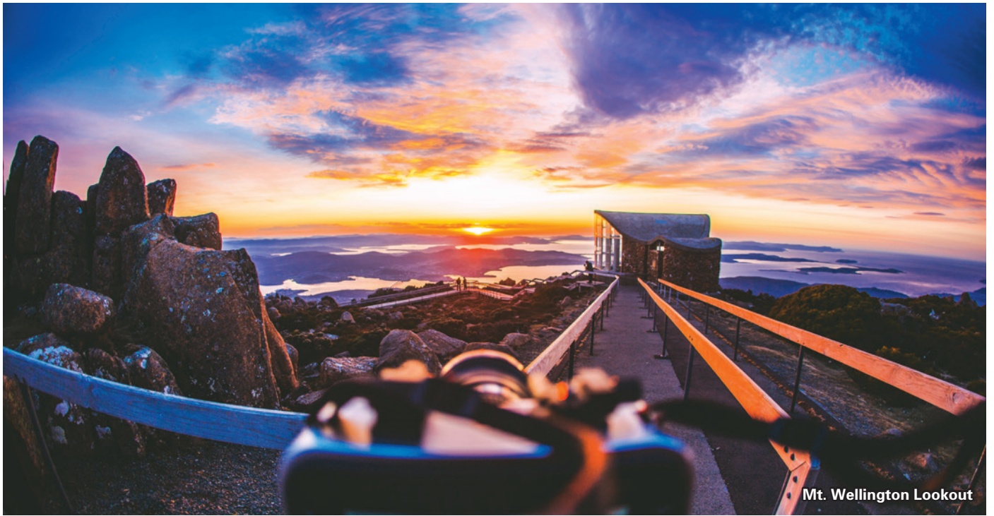
Mt. Wellington Lookout