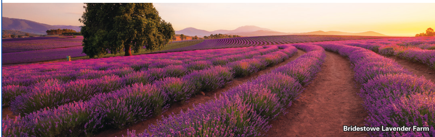
Bridestowe Lavender Farm

*DAY 3 onwards will proceed with the normal schedule.