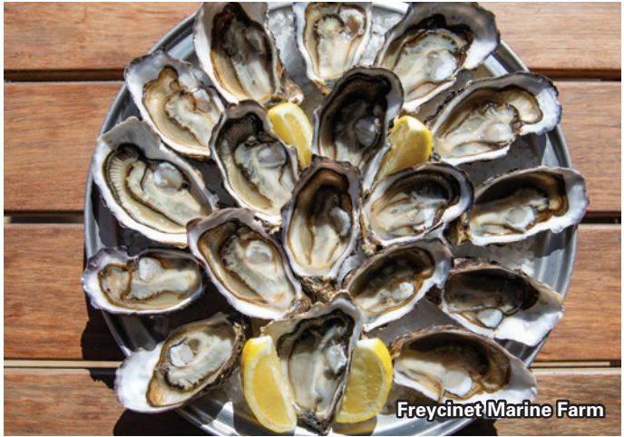
Freycinet Marine Farm