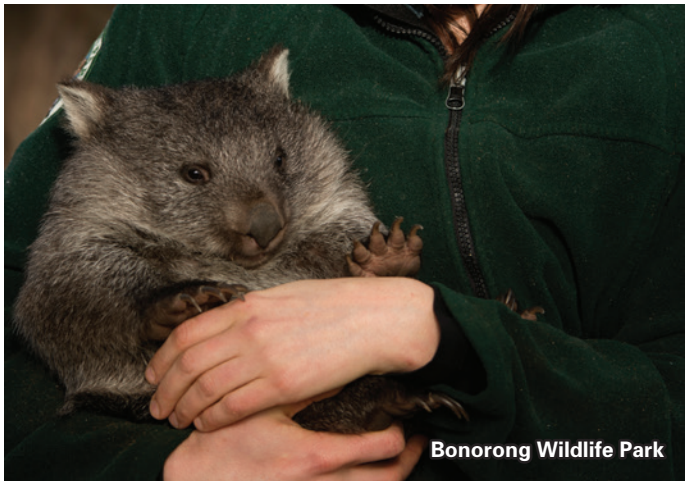
Bonorong Wildlife Park