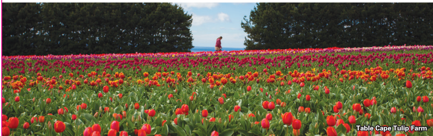
Table Cape Tulip Farm

*DAY 4 onwards will proceed with the normal schedule.