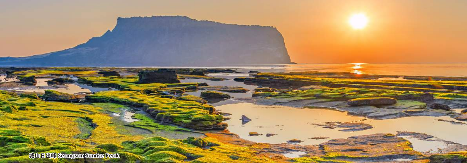
城山日出峰 Seongsan Sunrise Peak