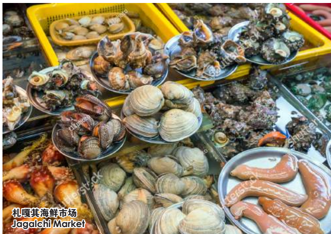
札嘎其海鲜市场 Jagalchi Market