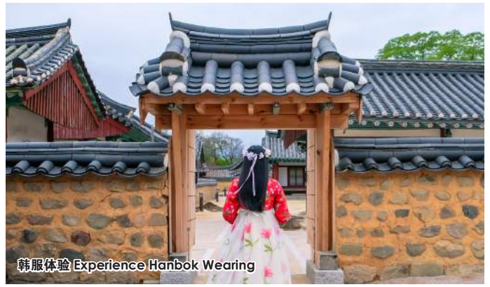
韩服体验 Experience Hanbok Wearing

Assorted Seafood With Chicken Steamboat | Black Pork Bulgogi + Hallasan Fried Rice | Sashimi Set | Seafood Buffet | Jeonju Bibimbap