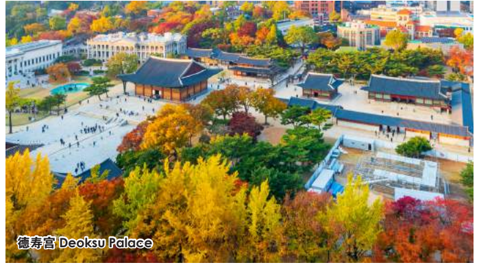
德寿宫 Deoksu Palace