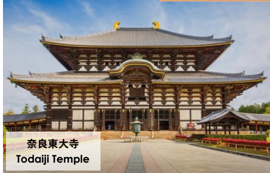
奈良東大寺 Todaiji Temple