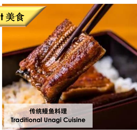
传统鳗鱼料理 Traditional Unagi Cuisine