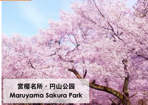
赏櫻名所・円山公園 Maruyama Sakura Park