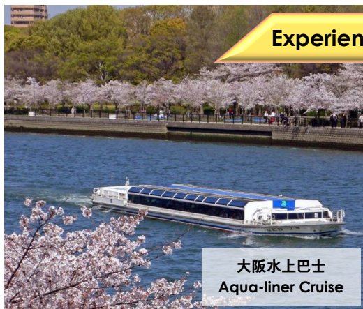
大阪水上巴士 Aqua-liner Cruise