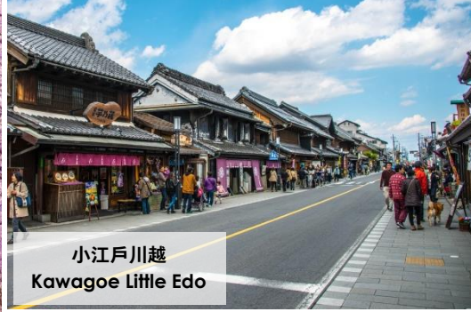
小江戸川越 Kawagoe Little Edo