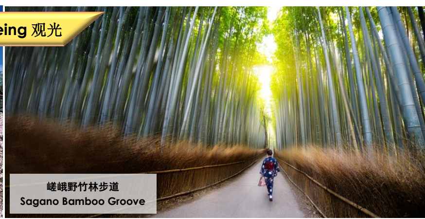
嵯峨野竹林步道 Sagano Bamboo Groove