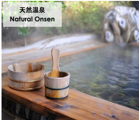
天然温泉 Natural Onsen