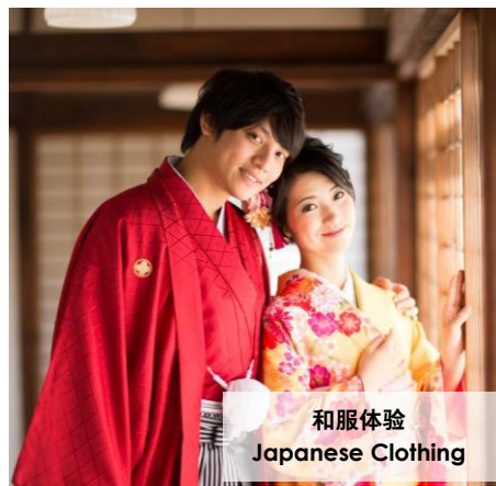
和服体验 Japanese Clothing