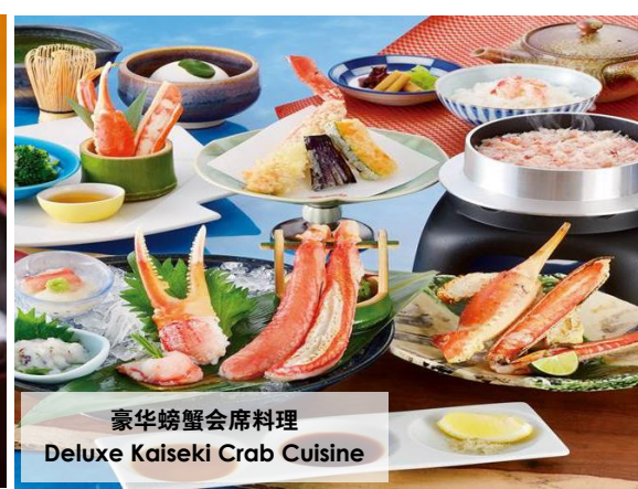
豪华螃蟹会席料理 Deluxe Kaiseki Crab Cuisine