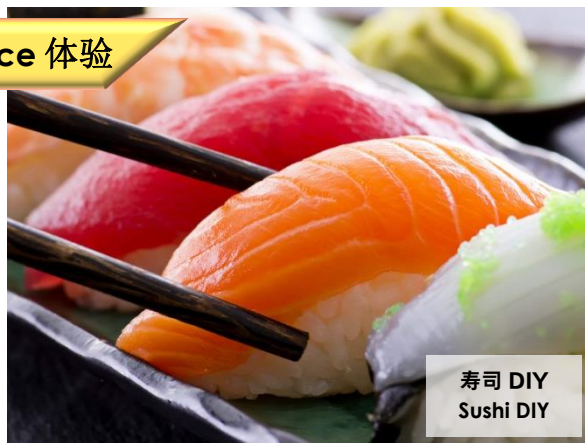
寿司 DIY Sushi DIY