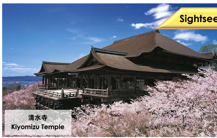
清水寺 Kiyomizu Temple