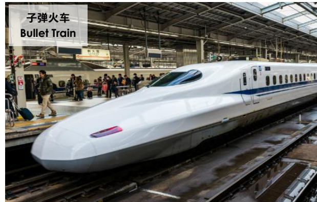
子弹火车 Bullet Train