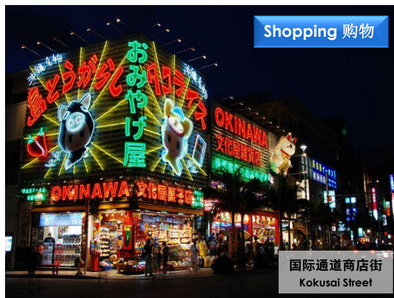
国际通道商店街 Kokusai Street