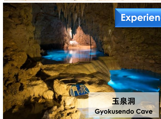
玉泉洞 Gyokusendo Cave