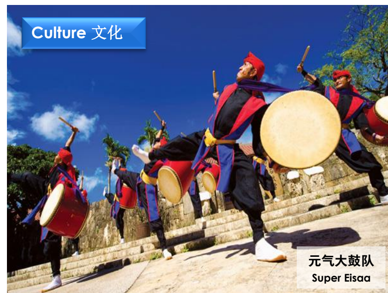
元气大鼓队 Super Eisa