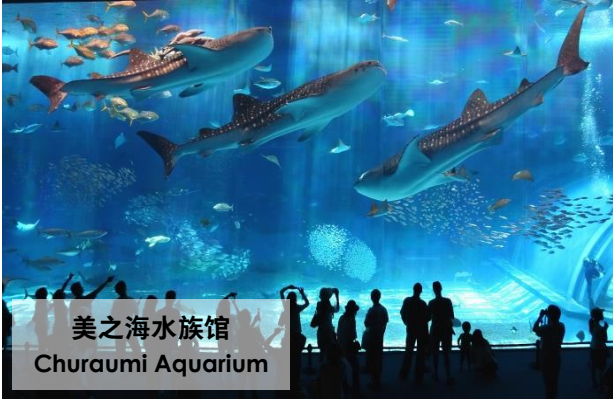
美之海水水族馆 Churaumi Aquarium