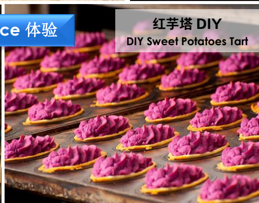
红芋塔 DIY DIY Sweet Potatoes Tart