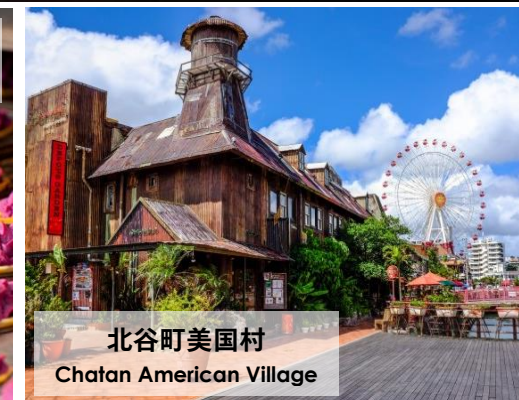
北谷町美国村 Chatan American Village