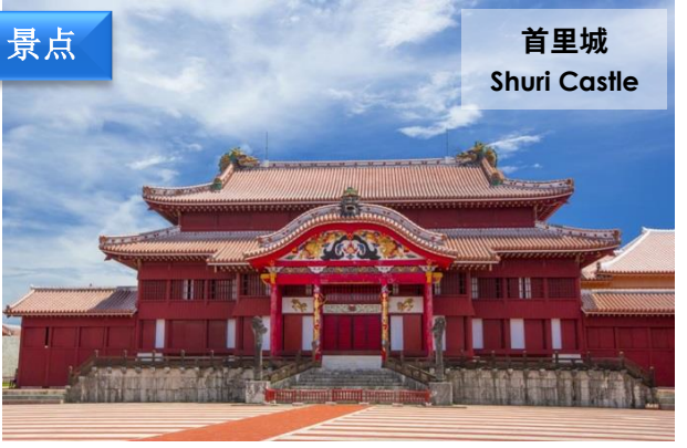
首里城 Shuri Castle