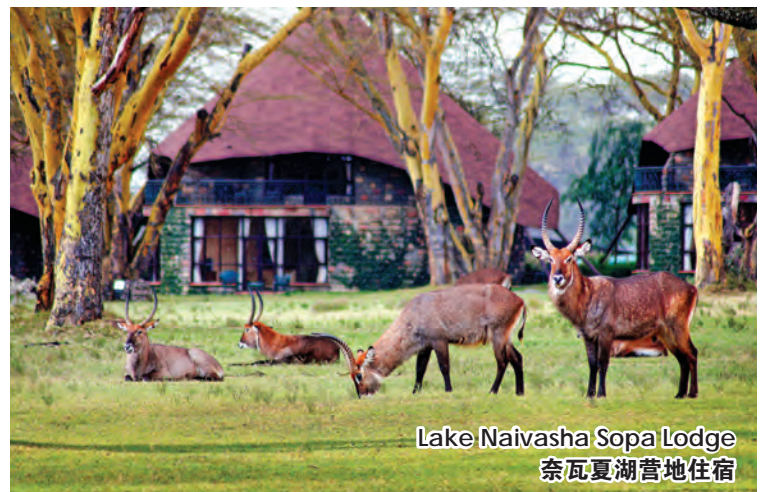
Lake Naivasha Sopa Lodge 奈瓦夏湖营地住宿