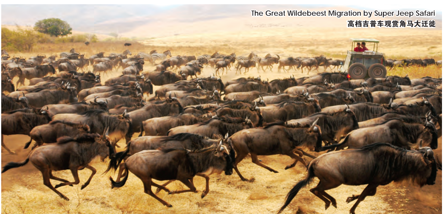
The Great Wildebeest Migration by Super Jeep Safari 高档吉普车观赏角马大迁徙