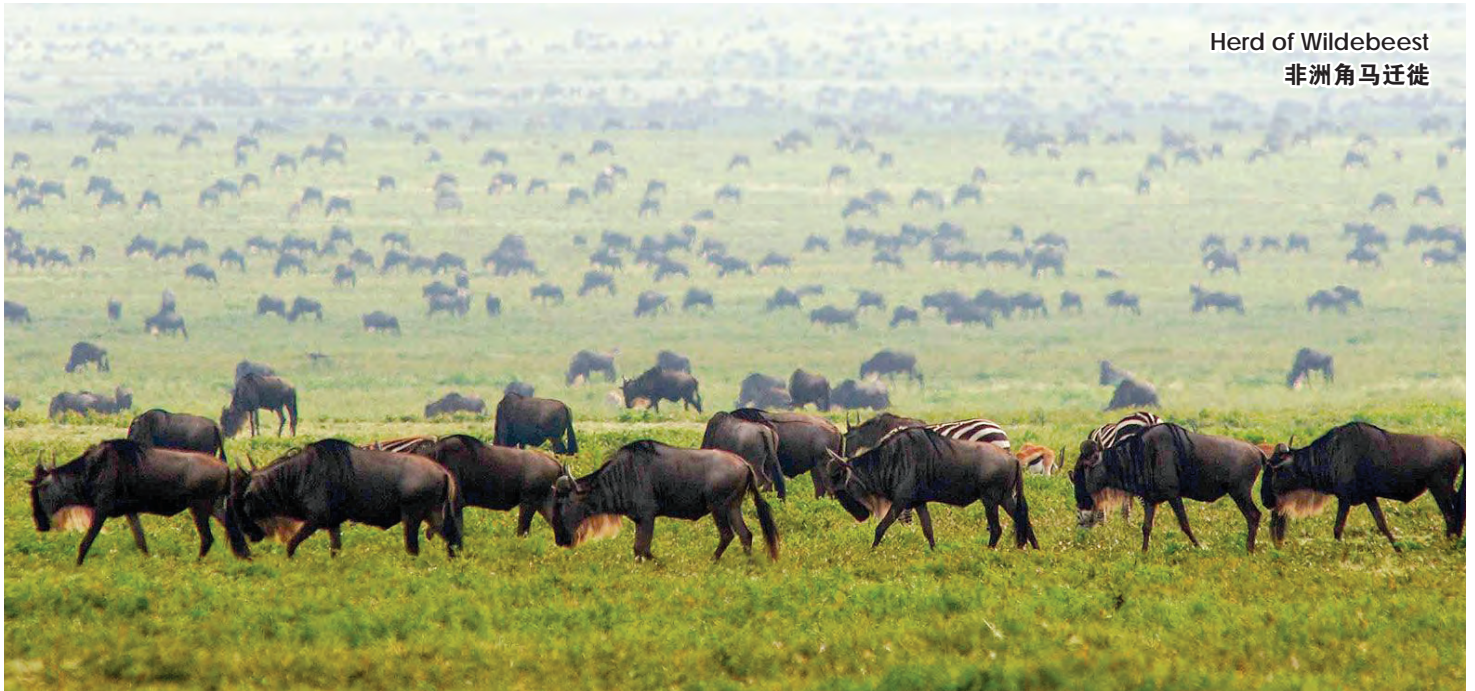
Herd of Wildebeest 非洲角马迁徙