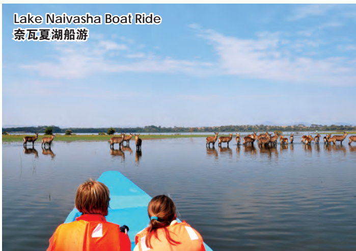
Lake Naivasha Boat Ride 奈瓦夏湖船游