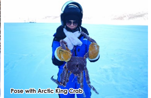
Pose with Arctic King Crab