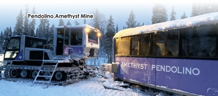
Pendolino, Amethyst Mine

After changing into your thermal outfits, hop on a sledge pulled by snowmobile to the frozen sea floors. Witness your hosts sawing a hole in the ice and pull up a huge bucket of the crabs. Pose with one and head back to the base for a feast of succulent Arctic King Crab !