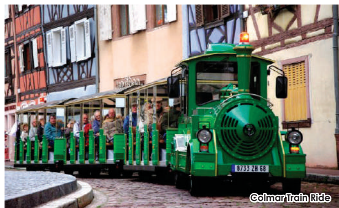
Colmar Train Ride

(The tourist train will be closed from 24 Dec to 31 Jan every year.)