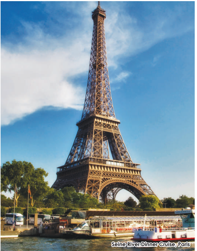
Seine River Dinner Cruise, Paris