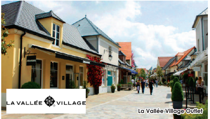
LA VALLÉE VILLAGE