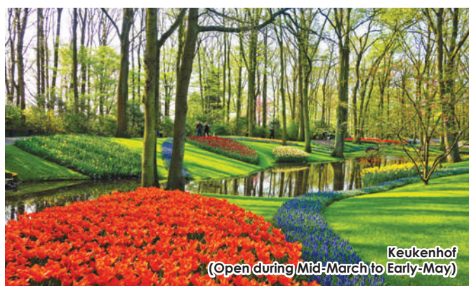
Keukenhof (Open during Mid-March to Early-May)