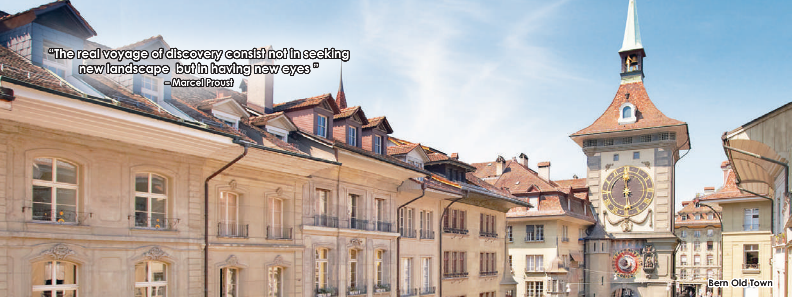
Bern Old Town