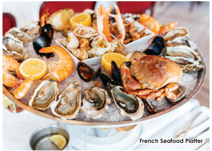
French Seafood Platter

Pose at the iconic Atomium structure, shaped like a unit cell of an iron crystal magnified 165 billion times. Amble along the vibrant streets of Brussels in search of the symbolic Manneken Pis before reaching the colourful Grand Place square surrounded by opulent guildhalls and the city's Town Hall.