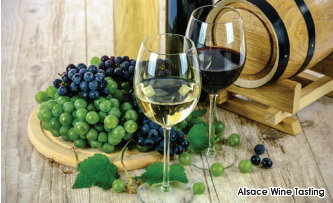
Alsace Wine Tasting