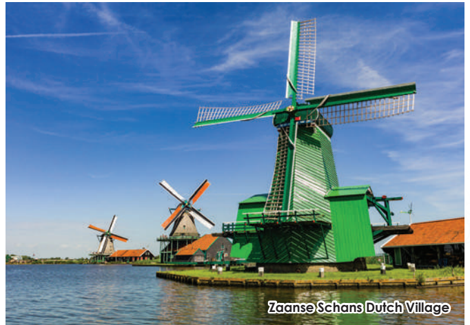
Zaanse Schans Dutch Village

Visit Zaanse Schans Dutch village , famous for its well preserved collection of historic windmills and Dutch houses . Next, browse a cheese and clog factory in the same village.