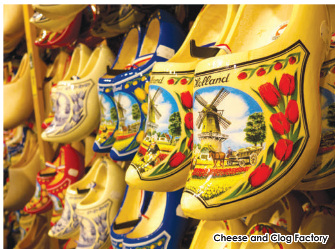
Cheese and Clog Factory

Board a romantic Seine River Dinner Cruise to admire the Notre Dame Cathedral & Ile de la Cite up close.