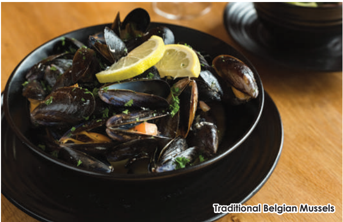
Traditional Belgian Mussels