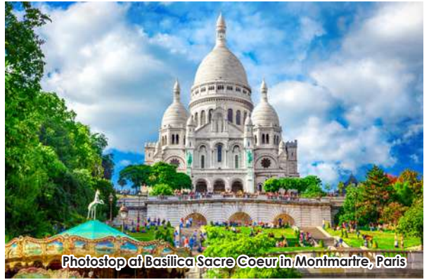
Photostop at Basilica Sacre Coeur in Montmartre, Paris

Note: All entrance tickets of the attractions listed above are included.