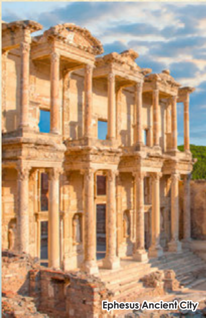
Ephesus Ancient City