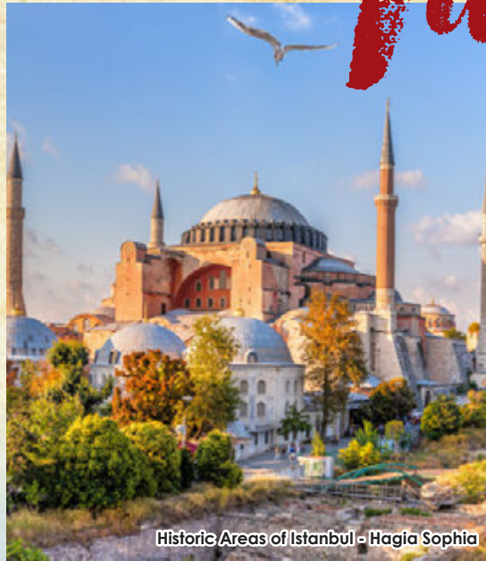
Historic Areas of Istanbul - Hagia Sophia