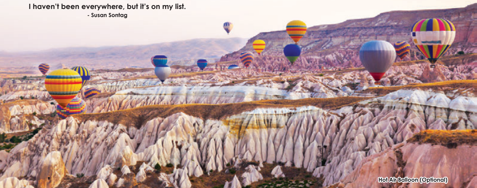
Hot Air Balloon (Optional)