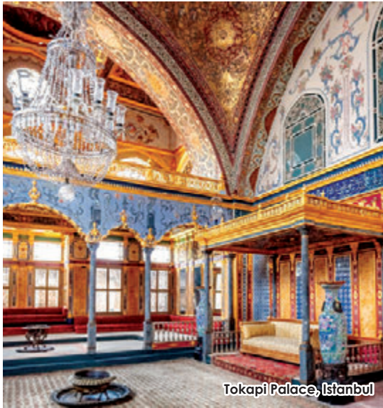
Tokapi Palace, Istanbul