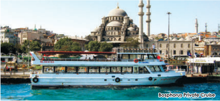
Bosphorus Private Cruise