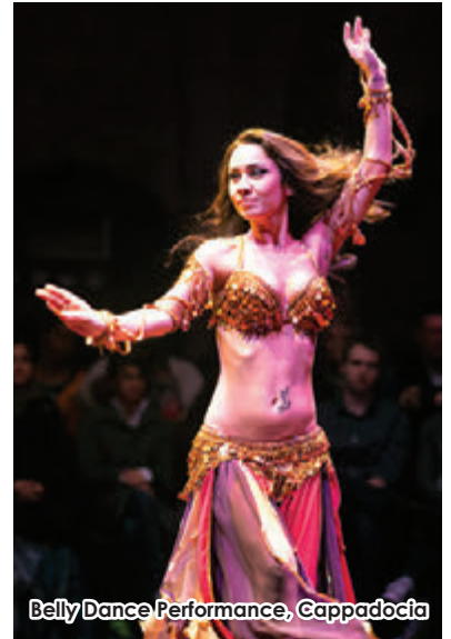
Belly Dance Performance, Cappadocia