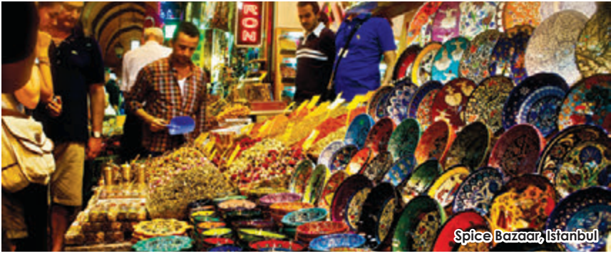
Spice Bazaar, Istanbul