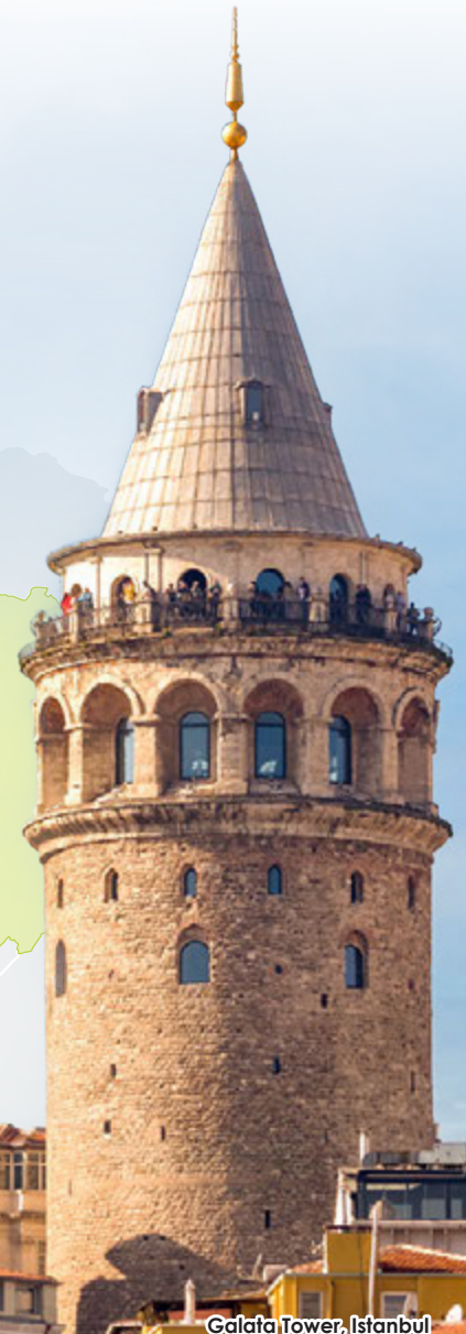
Galata Tower, Istanbul