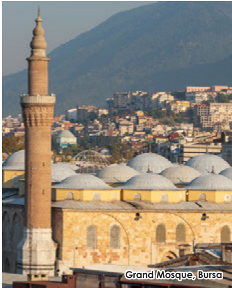
Grand Mosque, Bursa