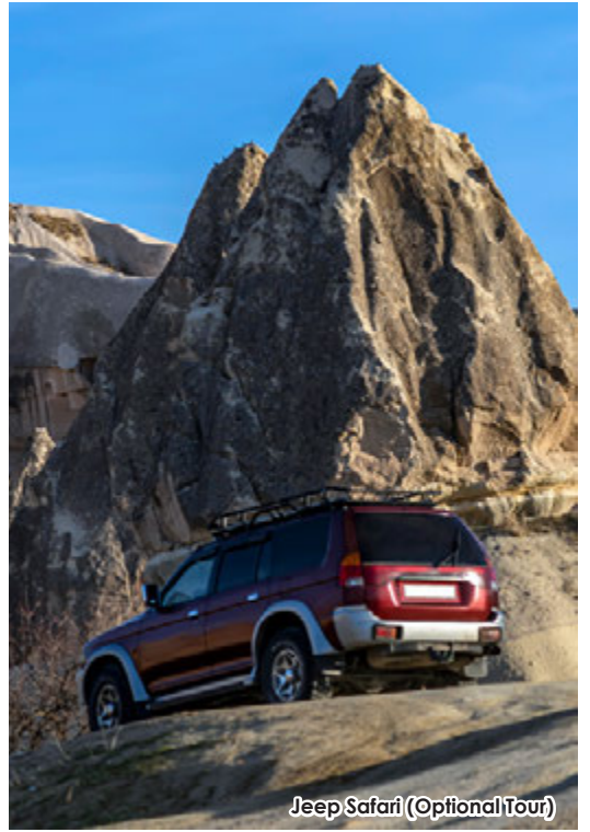
Jeep Safari (Optional Tour)