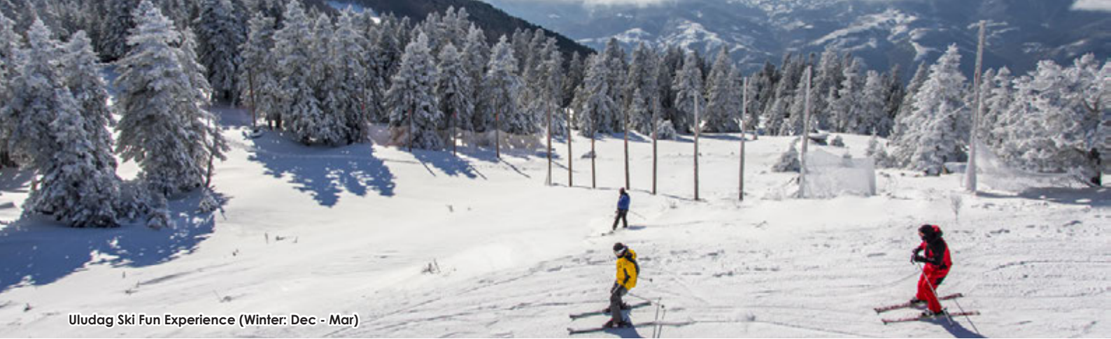
Uludag Ski Fun Experience (Winter: Dec - Mar)