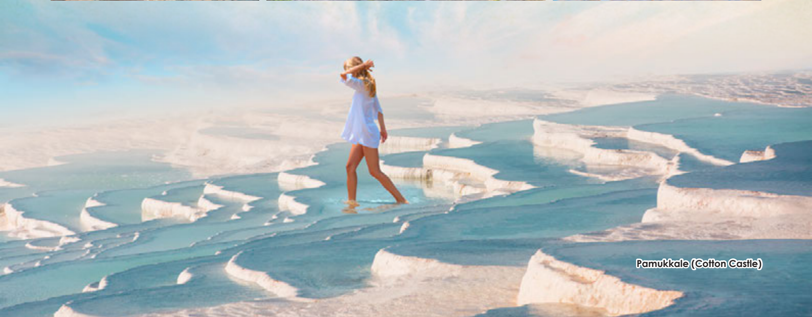
Pamukkale (Cotton Castle)