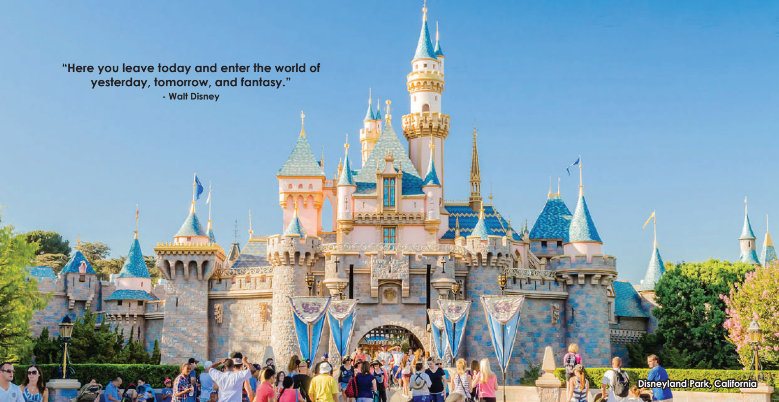
Disneyland Park, California