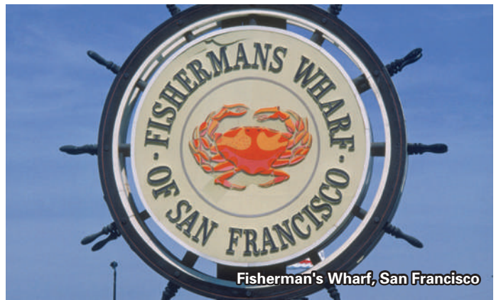
Fisherman's Wharf, San Francisco