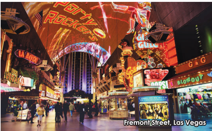
Fremont Street, Las Vegas