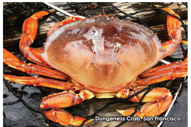
Dungeness Crab, San Francisco