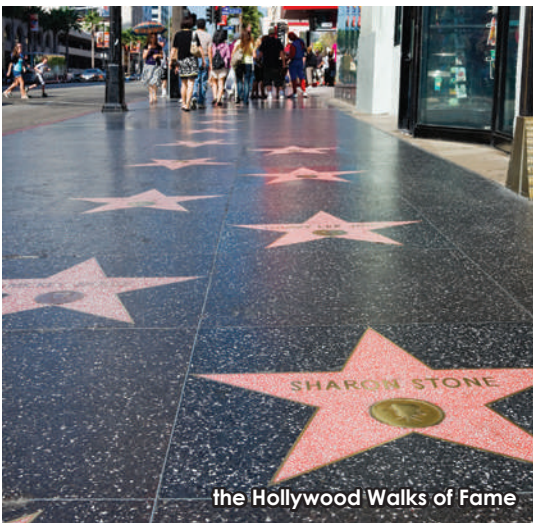
the Hollywood Walks of Fame