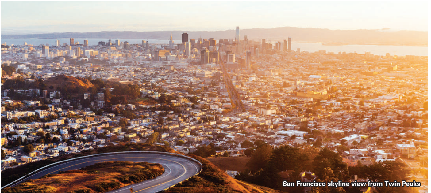
San Francisco skyline view from Twin Peaks