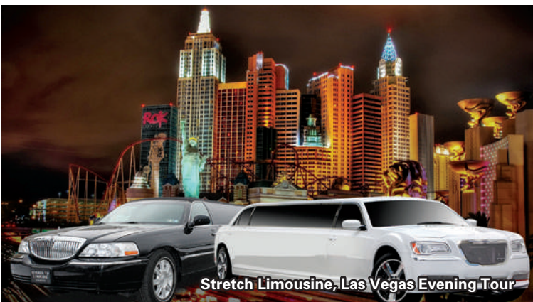
Stretch Limousine, Las Vegas Evening Tour