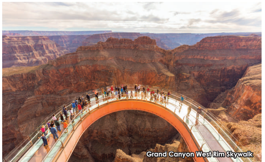
Grand Canyon West Rim Skywalk