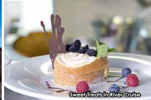
Sweet Treats in River Cruise