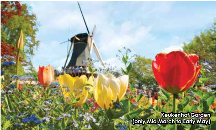
Keukenhof Garden (only Mid March to Early May)