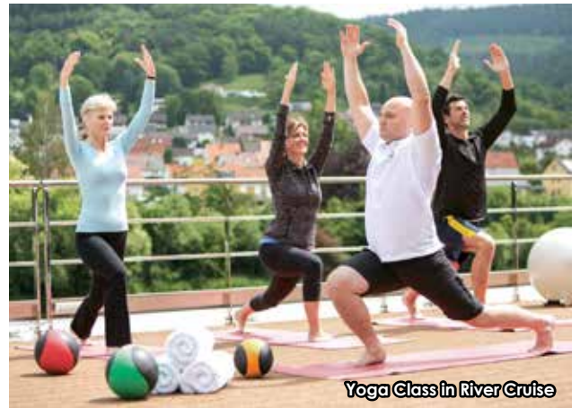
Yoga Class in River Cruise