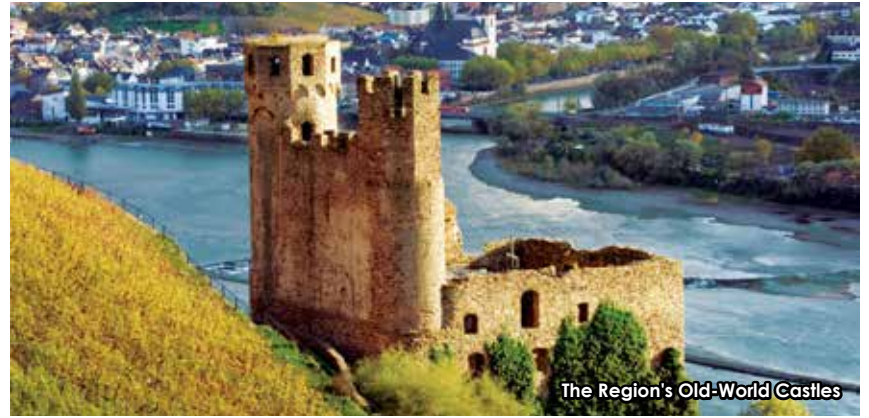
The Region's Old-World Castles