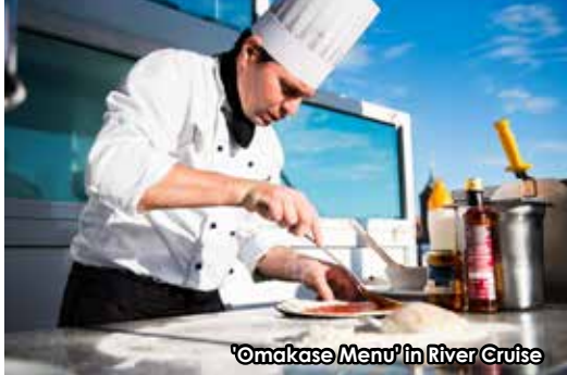
'Omakase Menu' in River Cruise