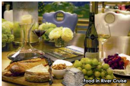
Food in River Cruise