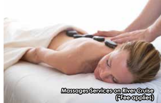
Massages Services on River Cruise (*Fee applies)