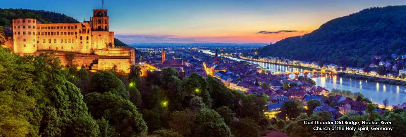
Carl Theodor Old Bridge, Neckar River, Church of the Holy Spirit, Germany