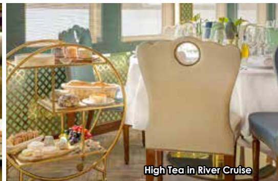
High Tea in River Cruise