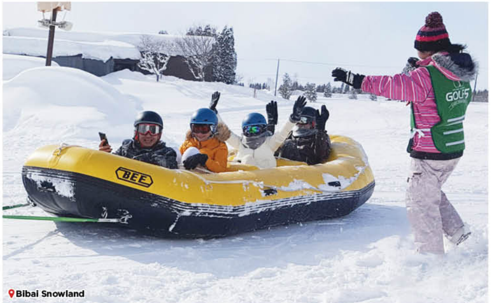
📍 Bibai Snowland