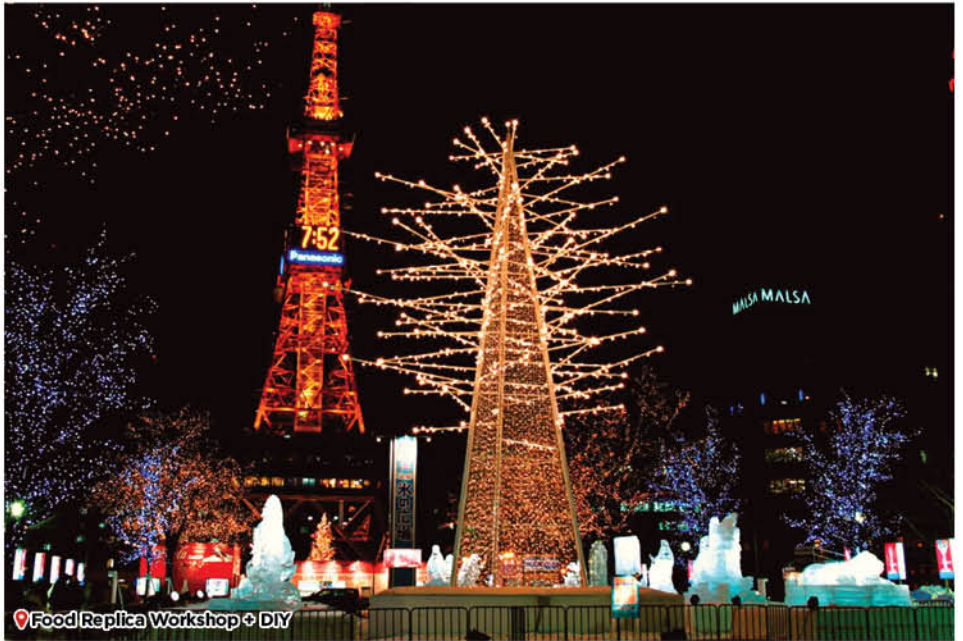
📍 Food Replica Workshop + DIY