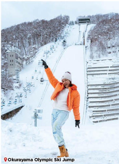
📍 Okurayama Olympic Ski Jump