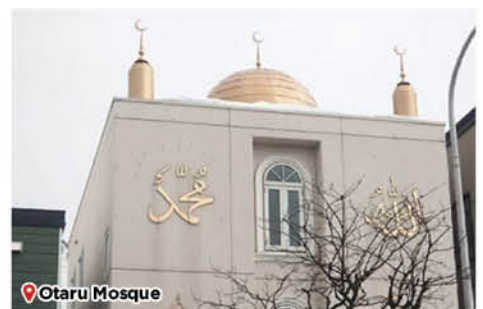
📍 Otaru Mosque