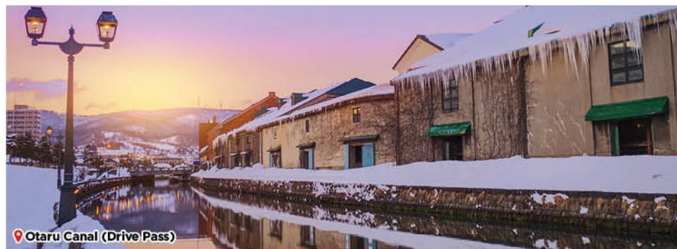
📍 Otaru Canal (Drive Pass)

Proceed to the airport for your flight back home.