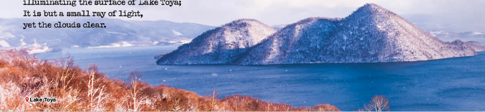
📍 Lake Toya

The sun shines through a break in the clouds, illuminating the surface of Lake Toya; It is but a small ray of light, yet the clouds clear.