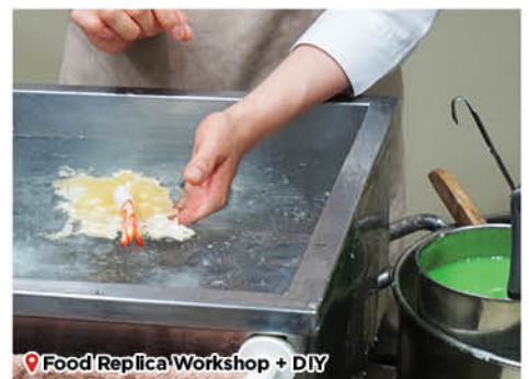
📍 Food Replica Workshop + DIY

Hokkaido also known as powder snow paradise. You can enjoy several snow activities such as snow banana boat rafting, tube and sled. (Subject to weather conditions)