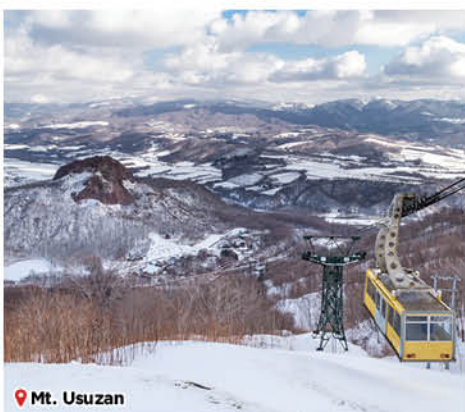
📍 Mt. Usuzan