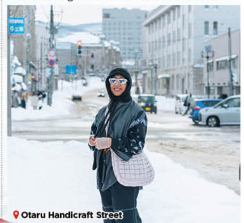
📍 Otaru Handicraft Street