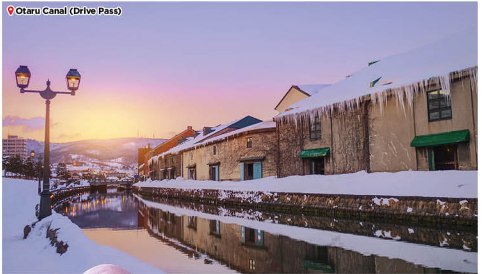
Otaru Canal (Drive Pass)

Otaru Handicraft Street: Renowned for its glass handicrafts, music box museum, art gallery, ice-cream & dessert shops. A perfect place for a stroll, souvenir shopping and to satisfy your sweet tooth! Drive pass Otaru Canal , one of the landmarks of Otaru.