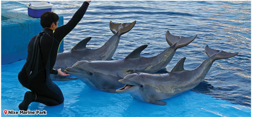
📍 Nixe Marine Park

📍 Noboribetsu Hot Spring: Stay one night in onsen resort and enjoy its hot springs that is well known in Hokkaido.