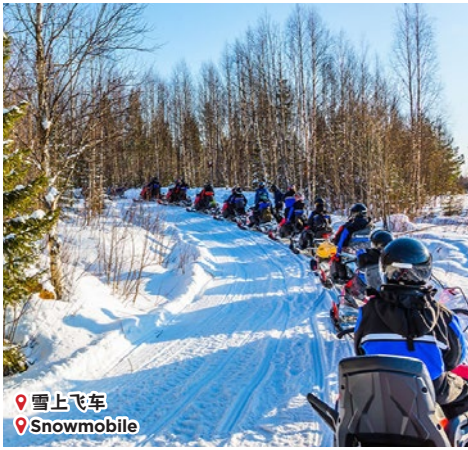
📍 雪上飞车 📍 Snowmobile