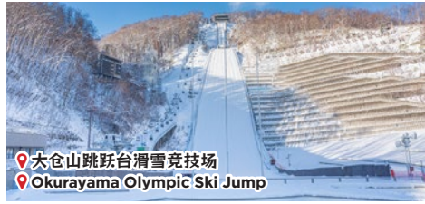
📍 大倉山跳躍台滑雪竞技场 📍 Okurayama Olympic Ski Jump