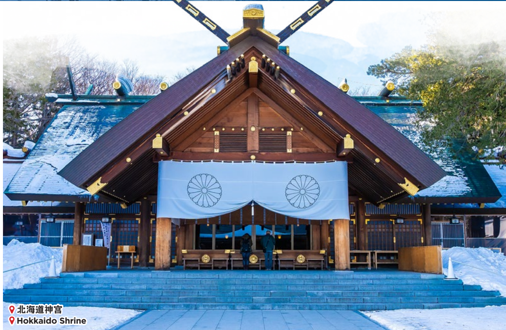
📍 北海道神宮 📍 Hokkaido Shrine