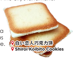
📍 白い恋人巧克力餅 📍 Shiroy Koibito Cookies