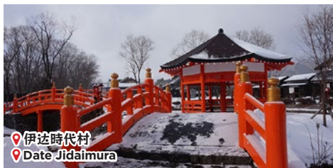
📍 伊達時代村 📍 Date Jidaimura