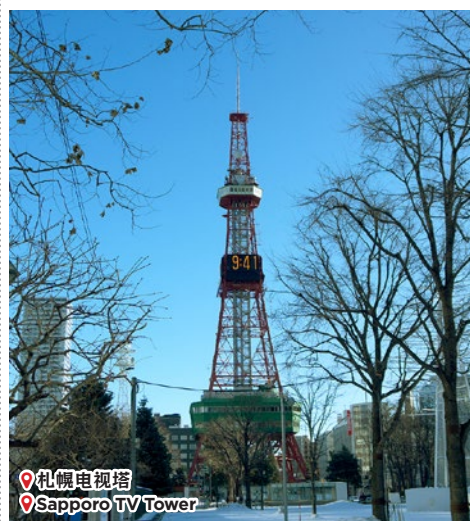
札幌电视塔 Sapporo TV Tower