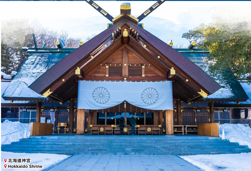
📍 北海道神宮 📍 Hokkaido Shrine