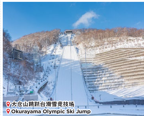
大仓山跳跃台滑雪竞技场 Okurayama Olympic Ski Jump