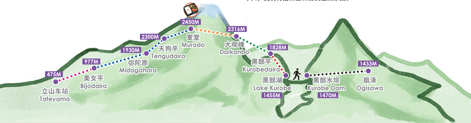
立山黑部阿尔卑斯路线 TATEYAMA KUROBE ALPINE ROUTE: