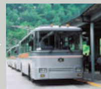
关电隧道电气巴士 Tunnel Electric Bus