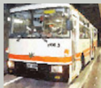
隧道无轨电车 Tunnel Trolley Bus