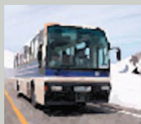
高原巴士 Highland Bus