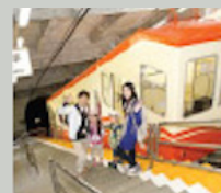
有轨缆车 Cable Car