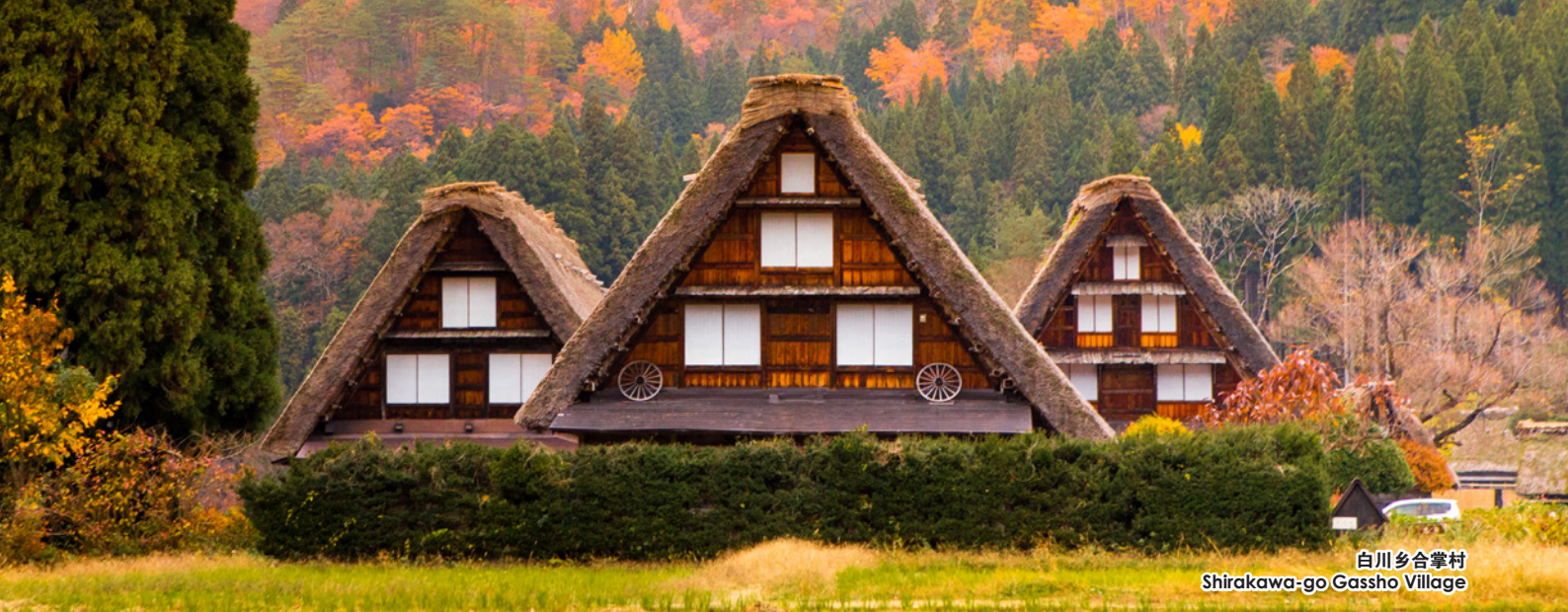
白川乡合掌村 Shirakawa-go Gassho Village