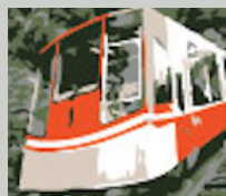
有轨缆车 Cable Car