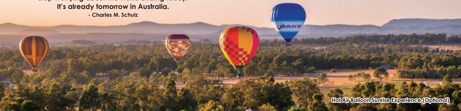
Hot Air Balloon Sunrise Experience (Optional)