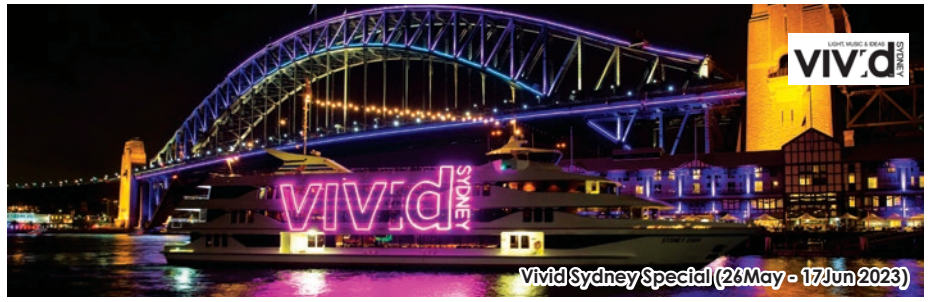
Vivid Sydney Special (26 May - 17 Jun 2023)