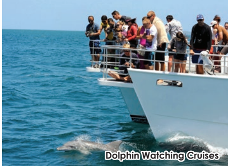
Dolphin Watching Cruises