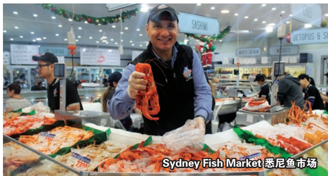
Sydney Fish Market 悉尼鱼市场