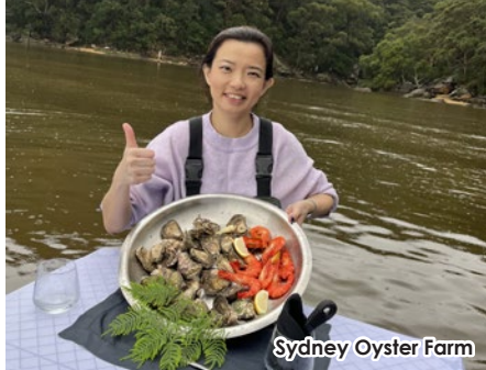
Sydney Oyster Farm