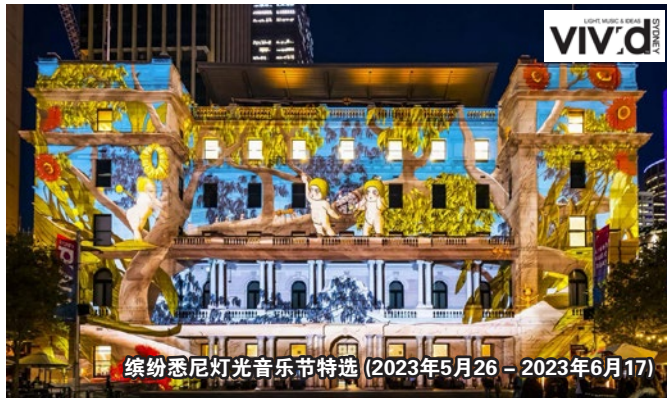
缤纷悉尼灯光音乐节特选 (2023年5月26 - 2023年6月17)