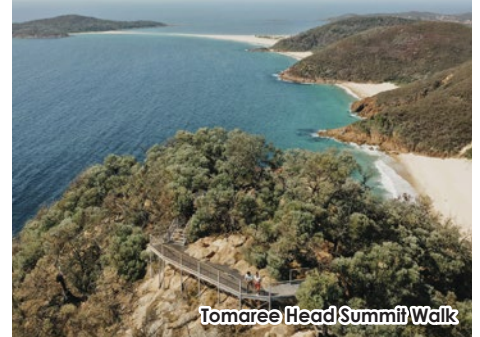
Tomaree Head Summit Walk