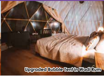
Upgraded Bubble Tent in Wadi Rum