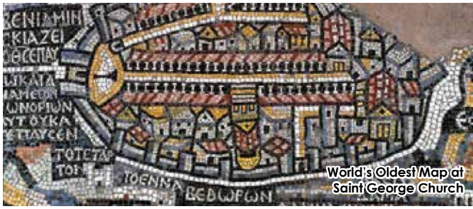
World's Oldest Map at Saint George Church