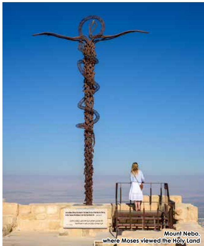
Mount Nebo, where Moses viewed the Holy Land

Remarks : This Itinerary is latest and correct when in the time of printing. The final day-by-day schedule is subjected to flight schedule and local situation arrangements.