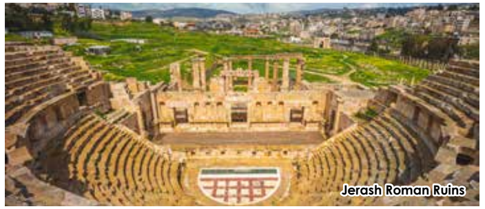
Jerash Roman Ruins