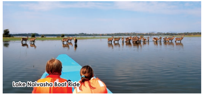
Lake Naivasha Boat Ride