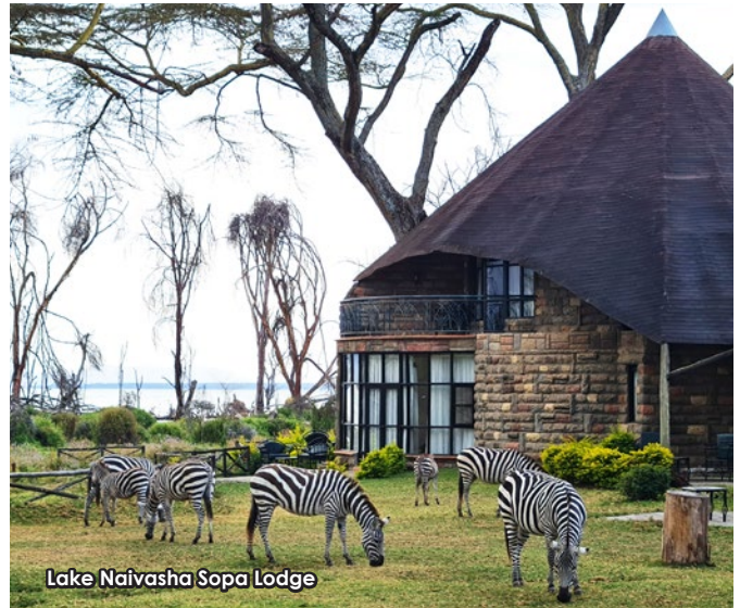
Lake Naivasha Sopa Lodge