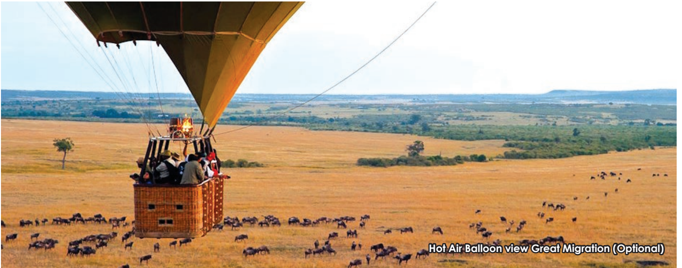
Hot Air Balloon view Great Migration (Optional)