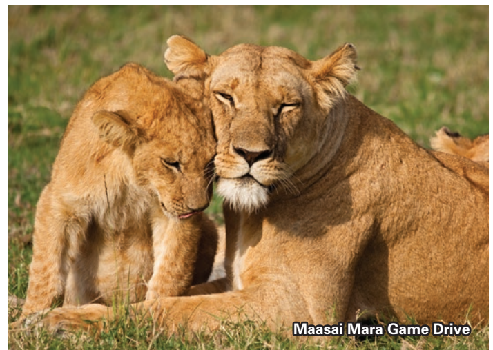
Maasai Mara Game Drive