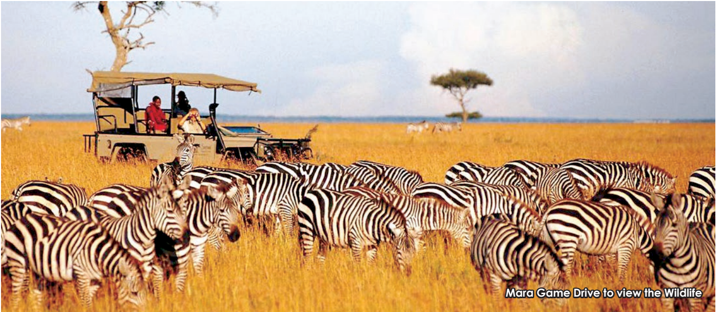
Mara Game Drive to view the Wildlife