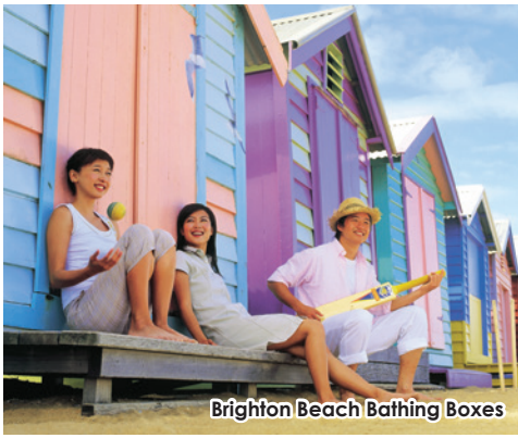
Brighton Beach Bathing Boxes