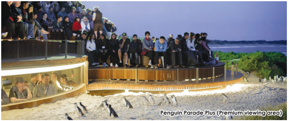
Penguin Parade Plus (Premium viewing area)