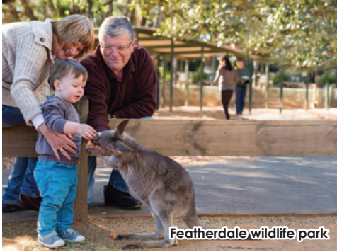
Featherdale wildlife park