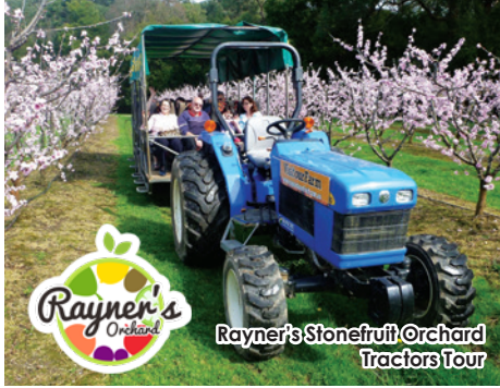
Rayner's Stonefruit Orchard Tractors Tour