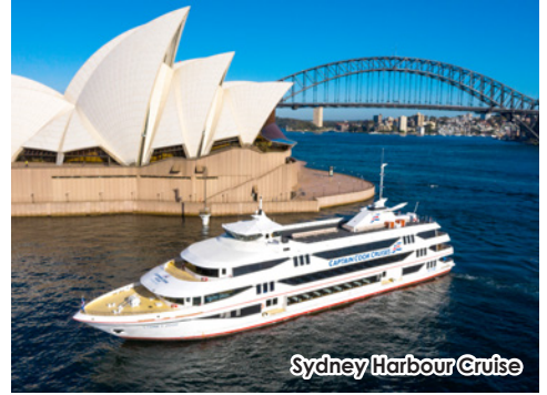
Sydney Harbour Cruise