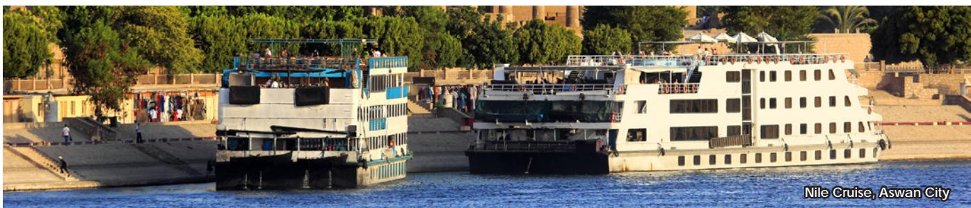
Nile Cruise, Aswan City