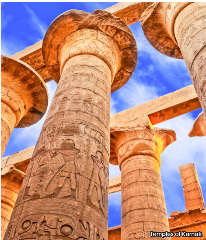
Temples of Karnak

Lastly, see the Step Pyramids of Djoser, Saqqara . Its distinctive architectural style identifies it as being among the oldest stone building in Egypt.