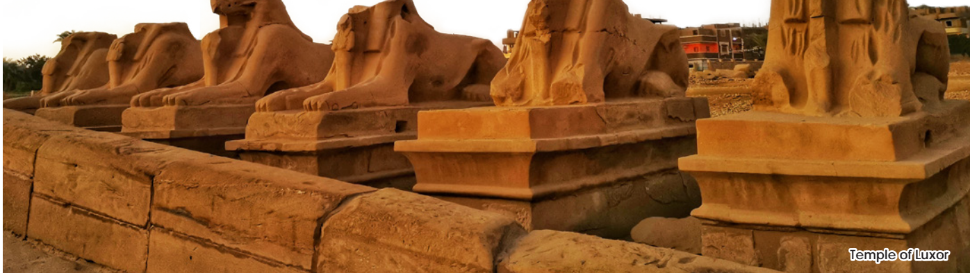
Temple of Luxor