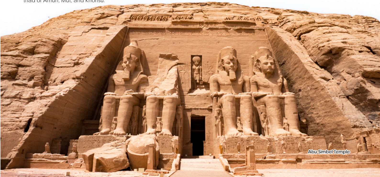
Abu Simbel Temple

Remarks : This Itinerary is latest and correct when in the time of printing. The final day-by-day schedule is subjected to Nile Cruise final schedule, Domestic flight schedule and local situation arrangements.