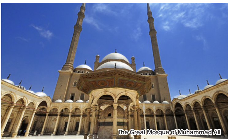
The Great Mosque of Muhammad Ali