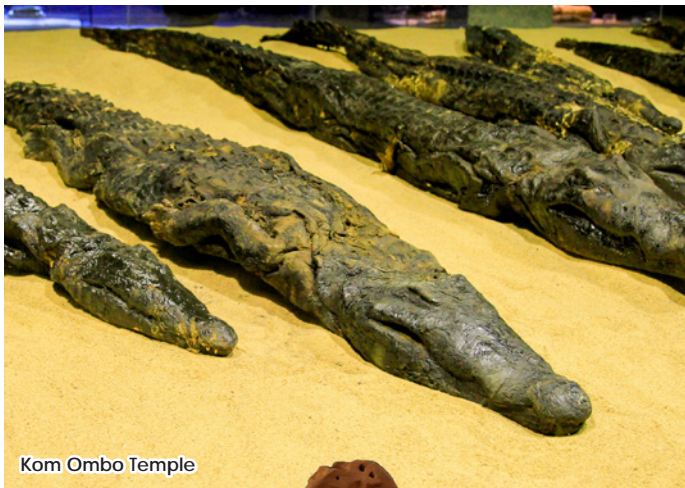
Kom Ombo Temple