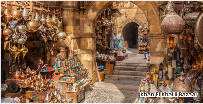
Khan El Khalili Bazaar