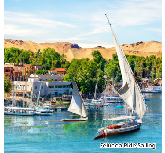
Felucca Ride Sailing