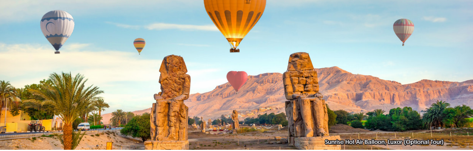
Sunrise Hot Air Balloon, Luxor (Optional Tour)