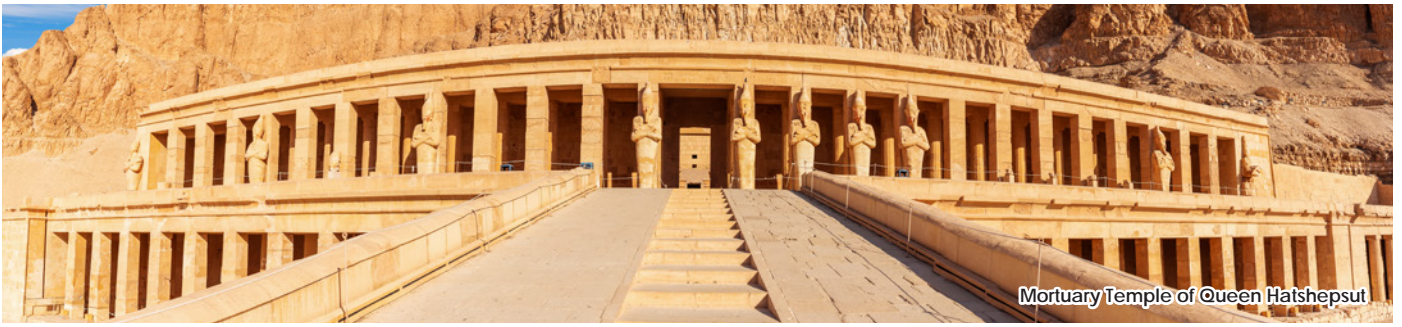
Mortuary Temple of Queen Hatshepsut