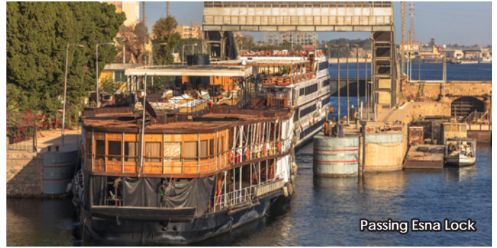
Passing Esna Lock