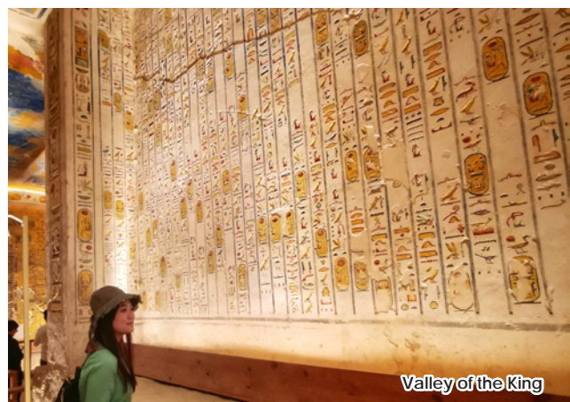
Valley of the King