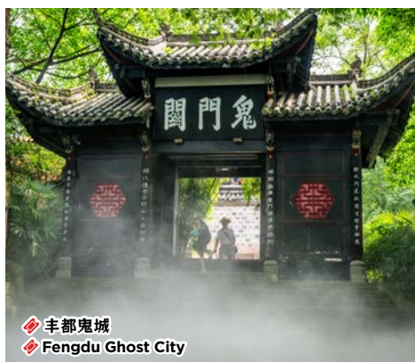
丰都鬼城 Fengdu Ghost City