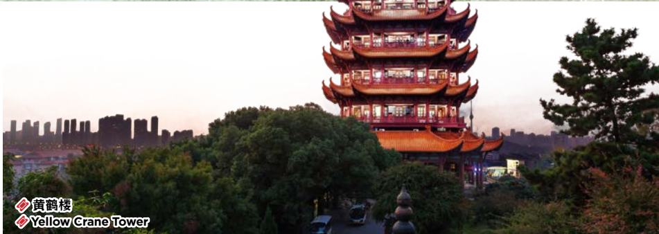
黄鹤楼 Yellow Crane Tower