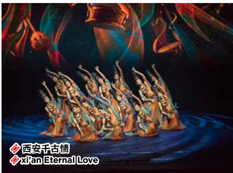
西安千古情 xi'an Eternal Love

以一位华裔少女回国寻根的故事为主线, 开启一次寻找民族记忆之旅, 犹如神奇的时空穿梭机, 全面立体展现周秦汉唐的宏大篇章。