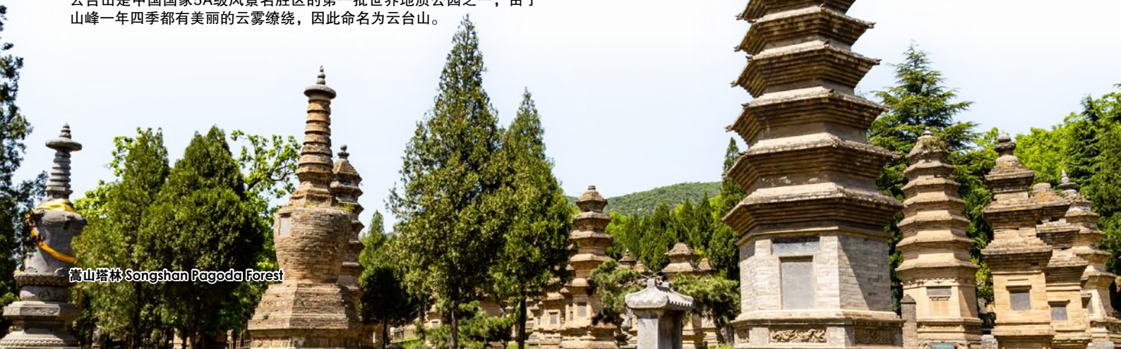
嵩山塔林 Songshan Pagoda Forest