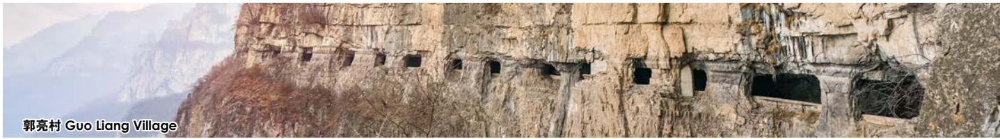
郭亮村 Guo Liang Village