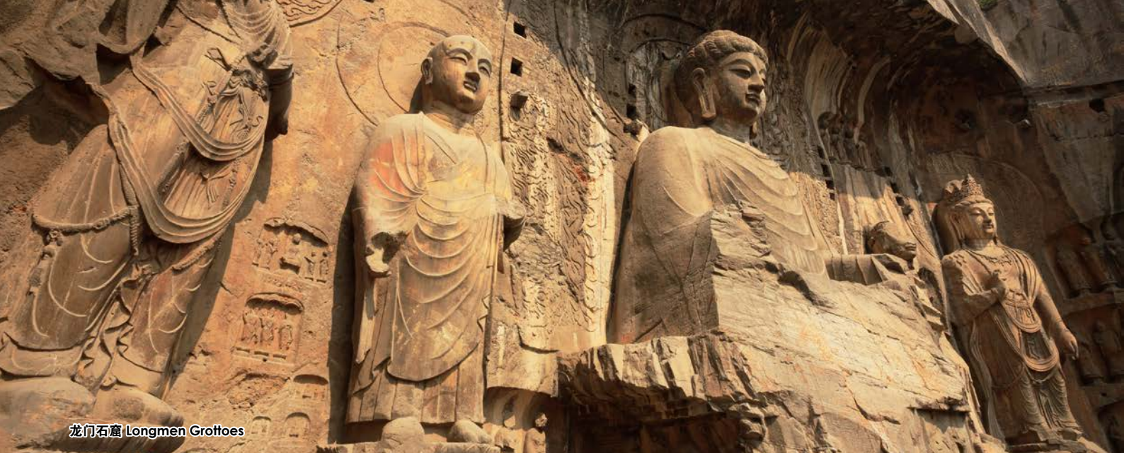
龙门石窟 Longmen Grottoes