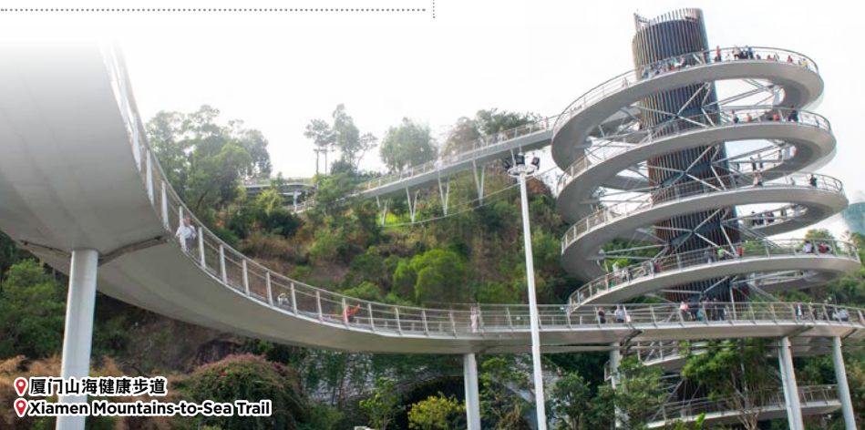
厦门山海健康步道 Xiamen Mountains-to-Sea Trail

Pass by the Gold Coast of Huandao Road and overlook Kinmen Island