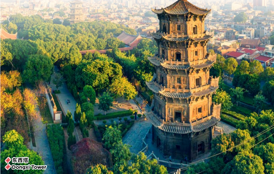
📍 东西塔 📍 Dongxi Tower