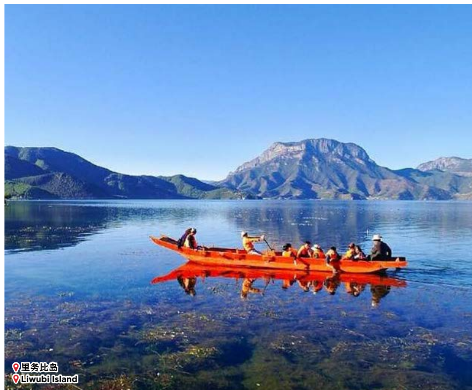
📍 里务比岛 Liwubi Island