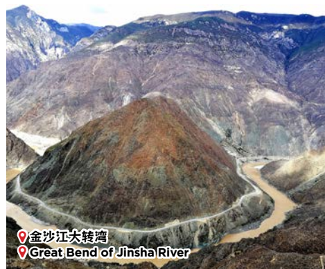
📍 金沙江大转弯 Great Bend of Jinsha River