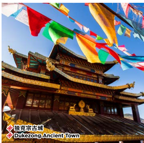
📍 独克宗古城 Dukezong Ancient Town

丽江古城，保存完好的文化灿烂的少数民族古城，是云南省纳西族丽江自治县的中心城市。