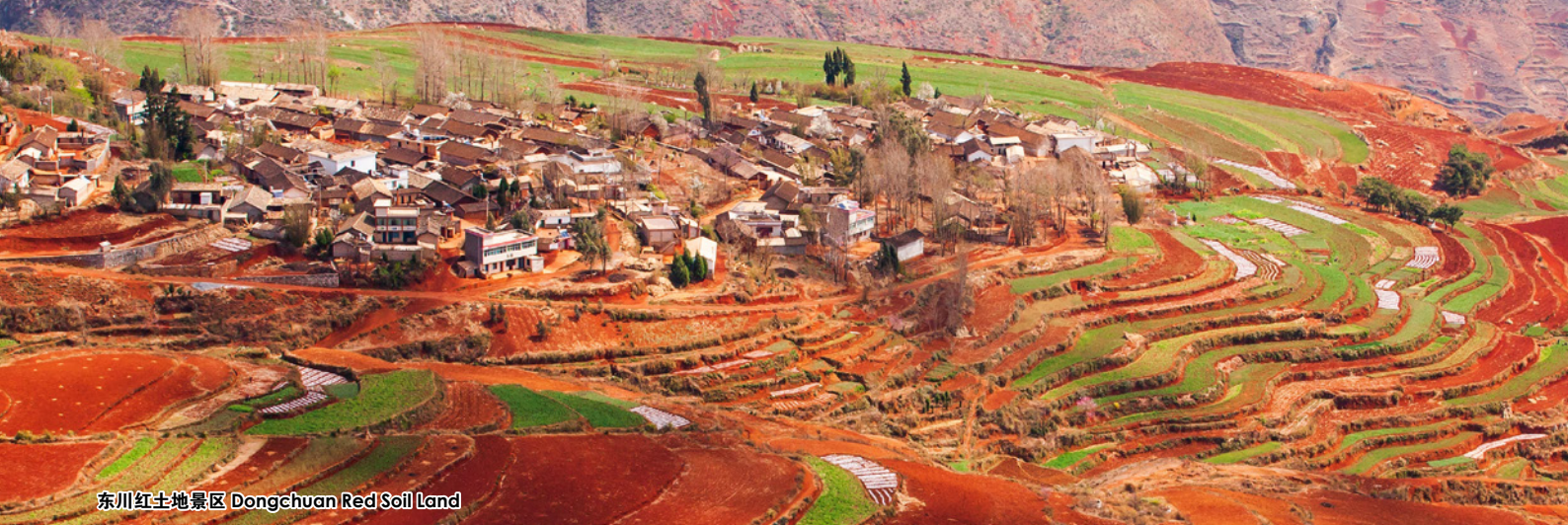
东川红土地景区 Dongchuan Red Soil Land