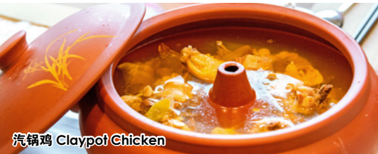
汽锅鸡 Claypot Chicken

野生菌火锅 - 云南十大经典名菜之一 精品土菜 + 篝火打跳 - 饮食文化深度交流 过桥米线 - 昆明市非物质文化遗产