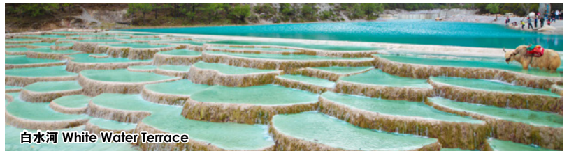
白水河 White Water Terrace

One of the Top 10 Kunming Classic Cuisine - Mushroom Hotpot Local Cuisine + Bonfire - Get to know the local culture while savour the food Kunming's City Intangible Cultural Heritage - Crossing-the Bridge Rice Noodle