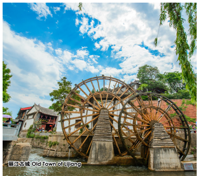
丽江古城 Old Town of Lijiang