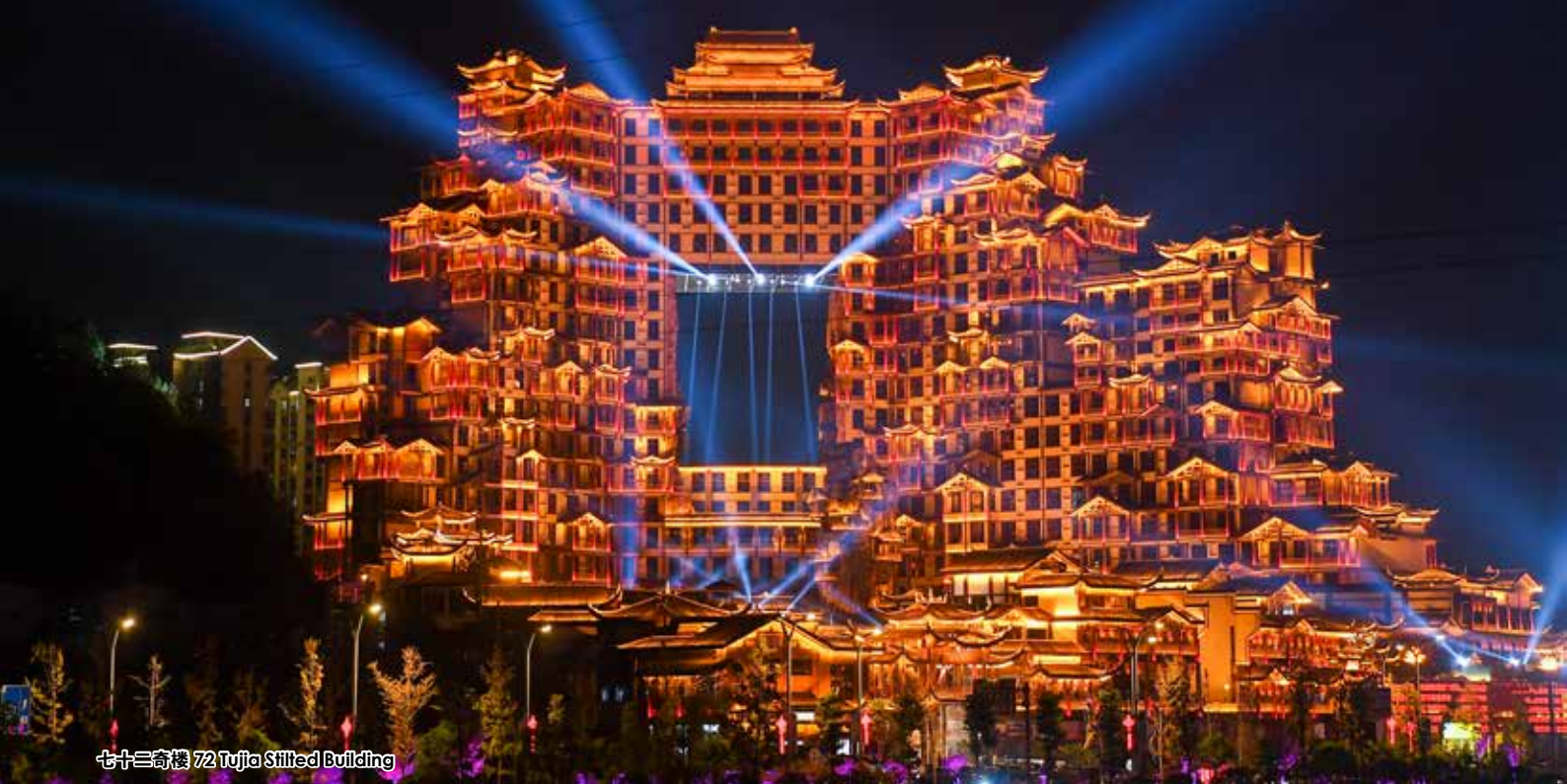
七十二奇楼 72 Stilted Building