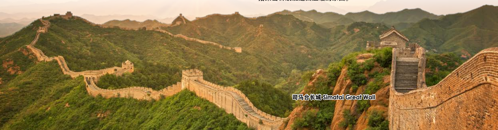
司马台长城 Simatai Great Wall