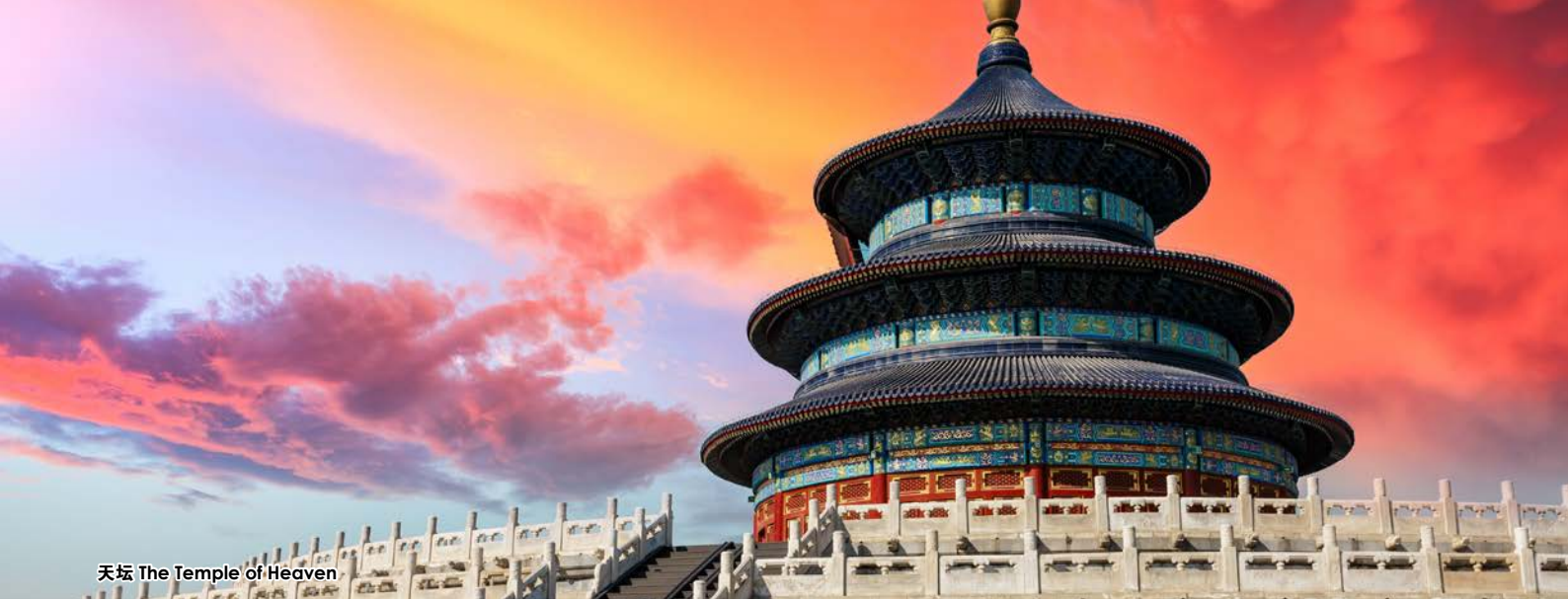
天坛 The Temple of Heaven