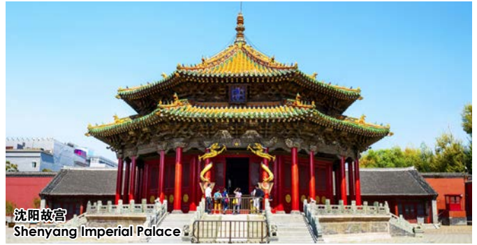
沈阳故宫 Shenyang Imperial Palace

[GOURMET] Japanese Buffet | Dongbei Cuisine | Manchu Cuisine | Seasonal arrangement - 2 Rivers Crab per person (Available from August 15th to September 30th)