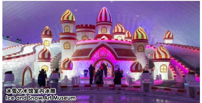
冰雪艺术馆室内冰雕 Ice and Snow Art Museum