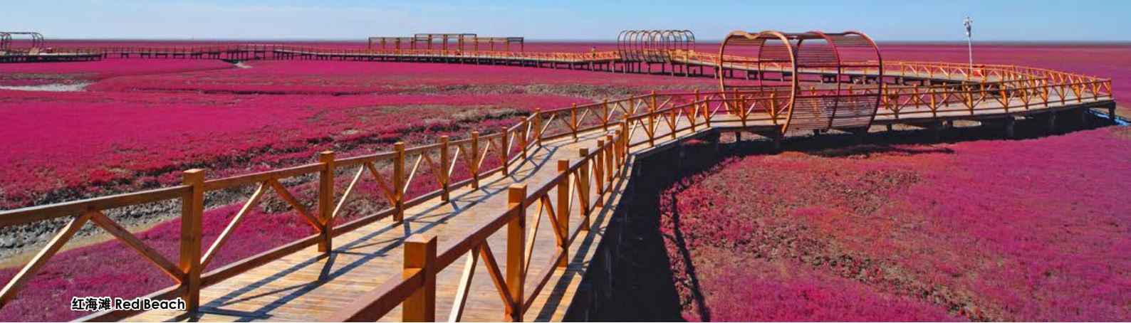
红海滩 Red Beach