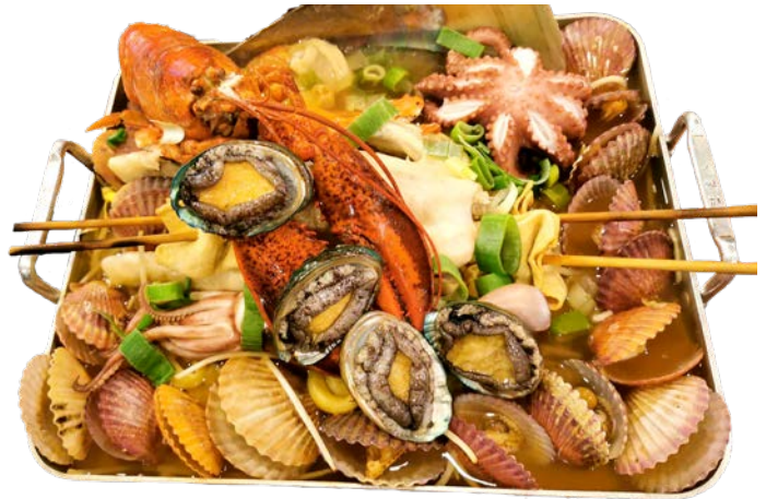
海鲜龙虾锅 Seafood Lobster Stew

[GOURMET] Korea Must Eat: Pan Broiled King Hairtail | Pan Fried Spicy Chicken | Black Pork Bulgogi High-Cost Meal: Long Leg Crab Ramen | Abalone Ginseng Chicken Soup | Seafood Lobster Stew