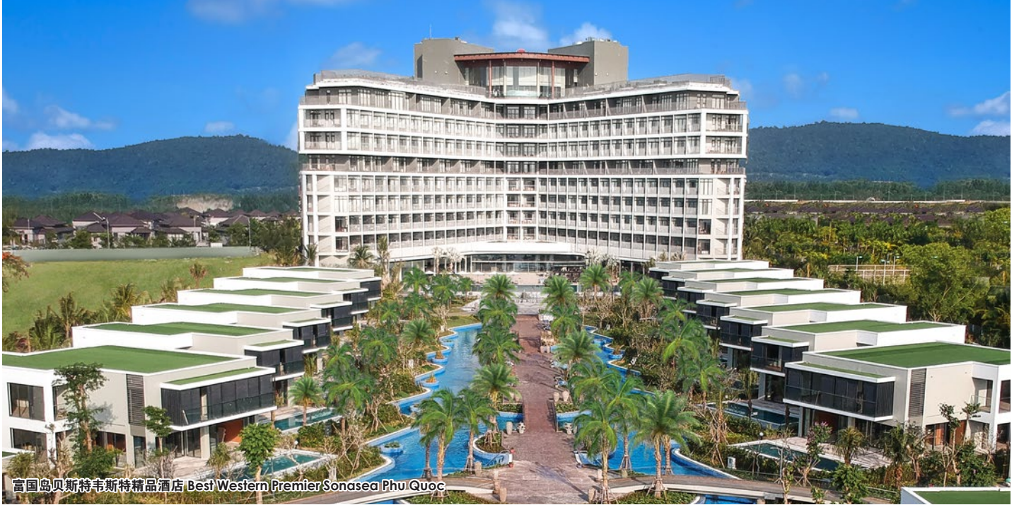
富国岛贝斯特韦斯特精品酒店 Best Western Premier Sonasea Phu Quoc