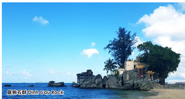
庭驹石群 Dinh Cau Rock