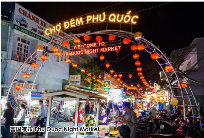
富国夜市 Phu Quoc Night Market

World's longest sea-crossing cable car 7.899,9m in length that officially opening in February 2018, connect An Thoi Town with Hon Thom Island, you soar over a turquoise sea and coral reefs, hopping between islands, with an amazing bird's-eye view. Take the Phu Quoc panorama photo & visit Hon Thom Nature Park.