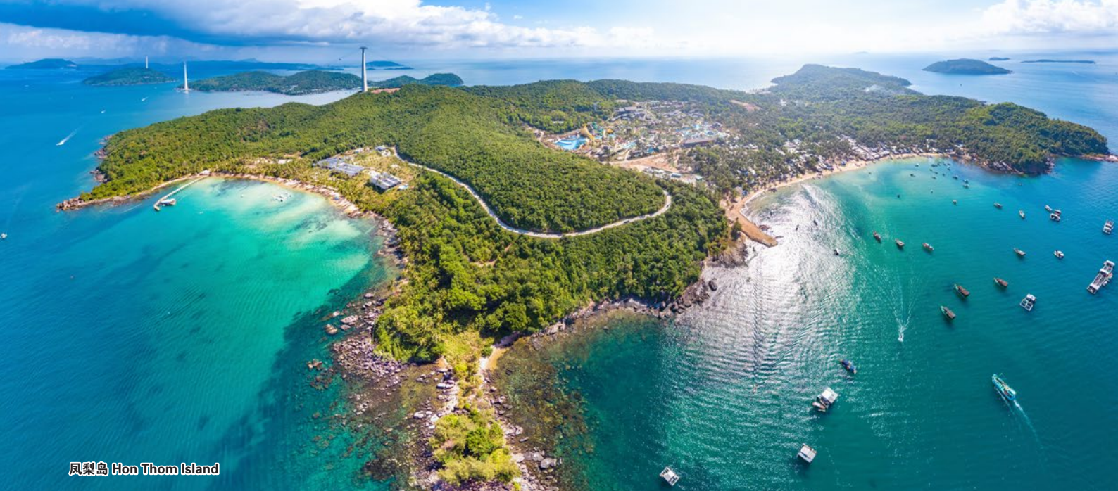
凤梨岛 Hon Thom Island