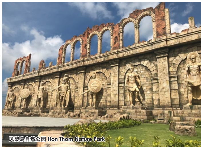
凤梨岛自然公园 Hon Thom Nature Park