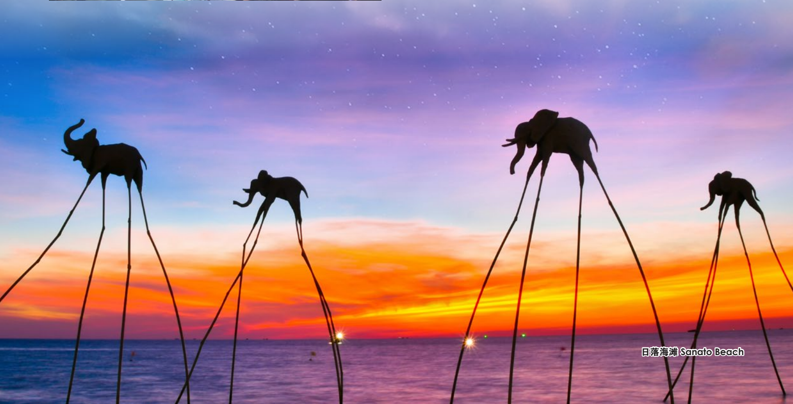
日落海滩 Sanato Beach