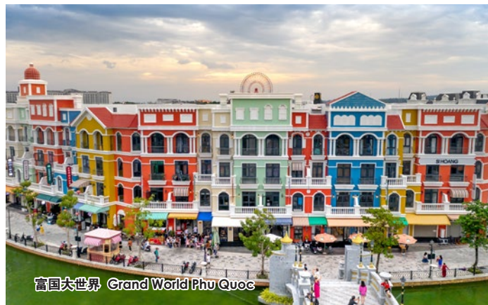
富国大世界 Grand World Phu Quoc