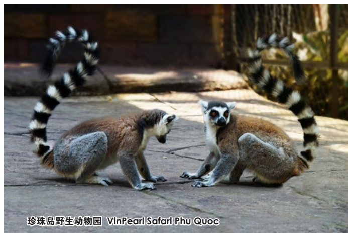
珍珠岛野生动物园 VinPearl Safari Phu Quoc