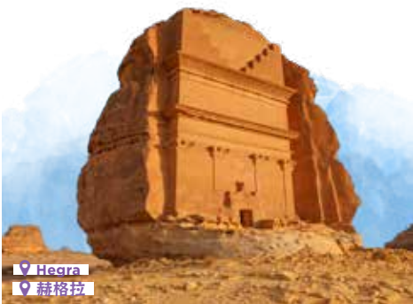
📍 Hegra 📍 赫格拉

大象岩 是世界上最受欢迎的岩石之一，看着巨大的象岩，很难不对其巨大的尺寸感到敬畏。这头猛犸象是由自然力量塑造而成的，躯干和身体是经过数百万年的水和风侵蚀而形成。巨大的大象站在金色的沙滩上，周围环绕着其他大小同样令人印象深刻的岩层。