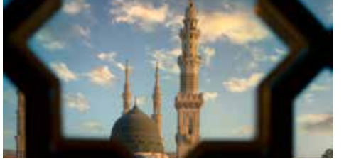
📍 Al-Masjid an-Nabawi (The Prophet's Mosque) 📍 先知清真寺

我们将前往麦地那市。该城市以 大清真寺 为中心，这里也被称为 先知清真寺 ，由先知本人建造，同时也是他被埋葬的地方。 乌胡德山 是主要的朝圣地点之一，是先知穆罕默德率领麦加的穆斯林部队所战斗的地方。这座山高1,077米，您可以攀登到山顶以更好地观察战场。附近是 乌胡德烈士陵园 ，那里埋葬了85名陨落的穆斯林士兵。 麦地那博物馆 ，展示了麦地那的遗产和历史，其中包括与麦地那有关的不同考古收藏，视觉画廊和稀有图像。