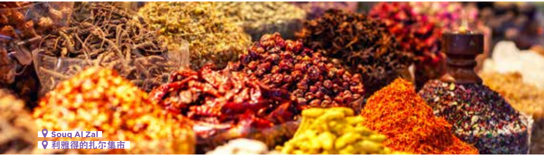
Souq Al Zal 利雅得的扎尔集市

*Meals & hotels above are subject to change without prior notice.