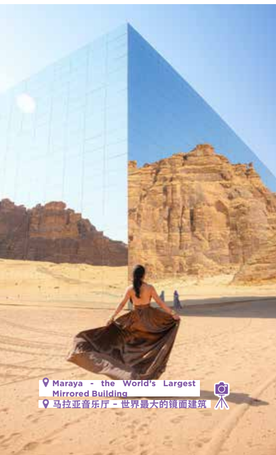
📍 Maraya - the World's Largest Mirrored Building 📍 马拉亚音乐厅 - 世界最大的镜面建筑

📍 Riyadh City Tour Built in 1865 and superbly preserved, Al Masmak Fortress is a vast clay and mud-brick citadel that's a favourite among tourists wanting to step back in time and explore Saudi's roots. Visit the city's most famous market - Souq Al Zal , which remains as noisy and vibrant as when it first emerged in 1901. Another must-visit location is the Saudi National Museum , which has more than 3,700 antiquities on display, documenting the grand history of Arabia over millennia. From there we will head to the famous Kingdom Centre Tower to see Riyadh from a panoramic viewpoint nearly 300 meters above the city.