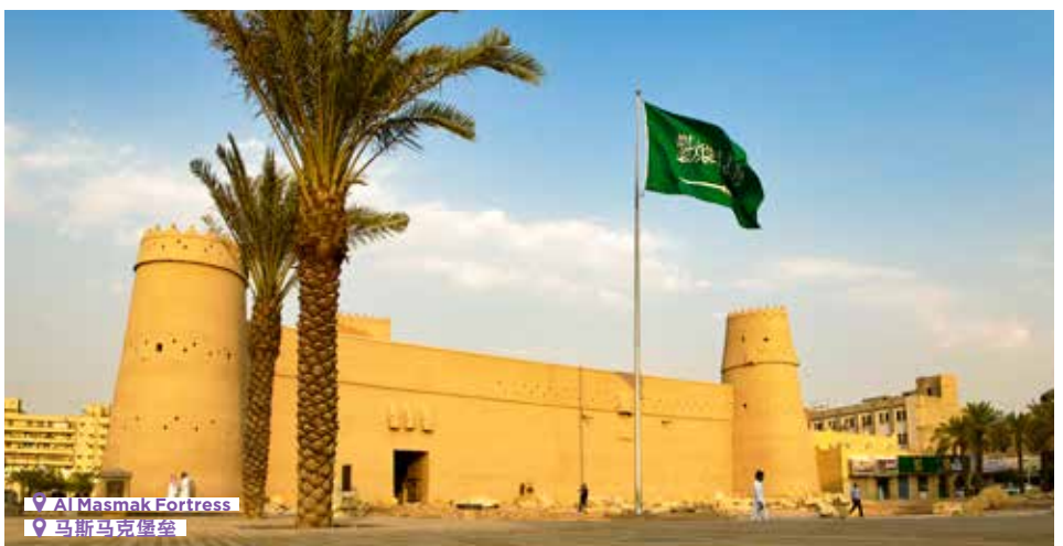
📍 Al Masmak Fortress 📍 马斯马克堡垒

📍 Travel up to Harat Auwyrith Visitors to AIUla get to explore the Elephant Rock which lies 11km northeast of the province, at a height of 52 meters. The natural formation looks like an elephant with a ground-bound trunk, and it is surrounded other hundreds of rock monoliths.