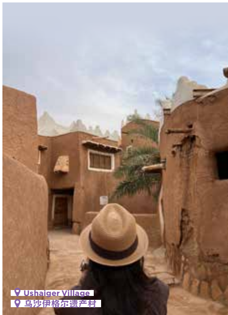
📍 Ushaiger Village 📍 乌沙伊格尔遗产村

🏠 Hotel Breakfast / Lunch / Dinner 📍 Ushaiger Village Ushaiger is one of the oldest towns in the Saudi region of Najd and it was a major stopping point for pilgrims coming from Kuwait, Iraq and Iran to perform Hajj or Umrah. The mountain is red in colour, yet locals said it was blonde simply because red and blonde were used interchangeably in the old days. Ushaiger means the "Small Blonde", which is a description of that particular mountain. The historical importance of the village is that its old mud buildings are still untouched. Therefore, it is considered one of the most attractive historical areas in the region.