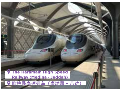
The Haramain High Speed Railway (Medina - Jeddah) 哈拉曼高速列车 (麦地那 - 吉达)

Breakfast at hotel then transfer to train station to Jeddah. Upon arrival tour in Jeddah. First, we will visit Al Rahma Floating Mosque . Located on the edge of the Corniche Road in Jeddah. It is marked by its bright white color and its turquoise dome which paints a wonderful scene especially when the sun shines on it to reflect the beauty of architecture joined with Islamic and traditional constructive art.