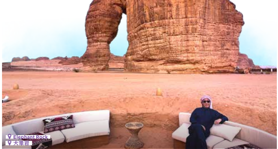
Elephant Rock 大象岩

We will drive towards the city of Medina. First up is the massive Al-Masjid an-Nabawi (The Prophet's Mosque) , with its amazing architecture, it is built where the Islamic prophet Muhammad used to live and is currently buried. Mount Uhud 1,077 m high and 7.5 km long. It was the site of the second battle between Muslim and unbelievers. Al-Madinah Museum , that exhibits Al-Madina heritage and history featuring different archaeological collections, visual galleries and rare images that related to Al-Medina.