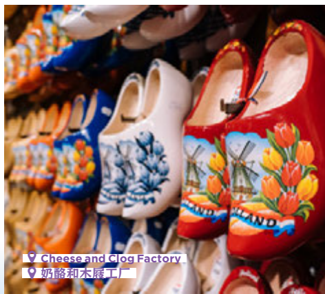
Cheese and Clog Factory 奶酪和木屐工厂