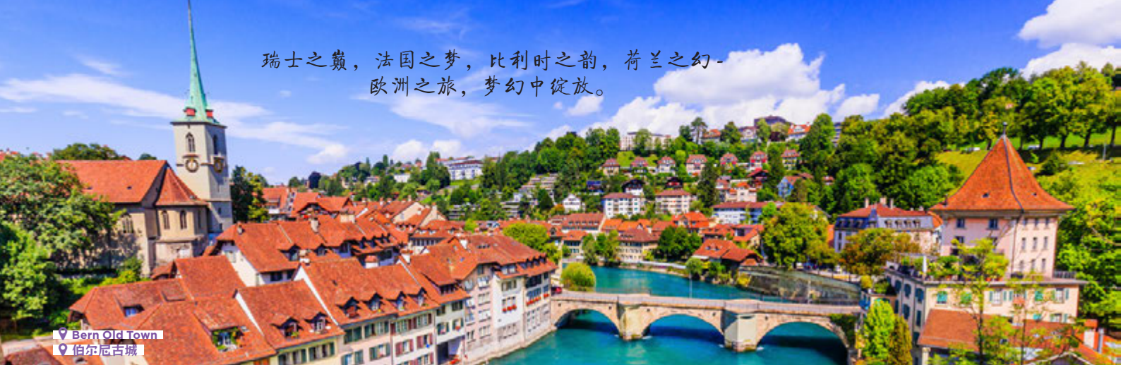
Bern Old Town 伯尔尼古城