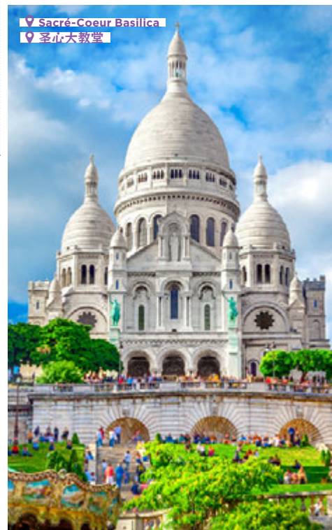
Sacré-Coeur Basilica 圣心大教堂

📍 Seine River Dinner Cruise (France) Board a romantic Seine River Dinner Cruise to admire the Notre Dame Cathedral & Ile de la Cite up close.