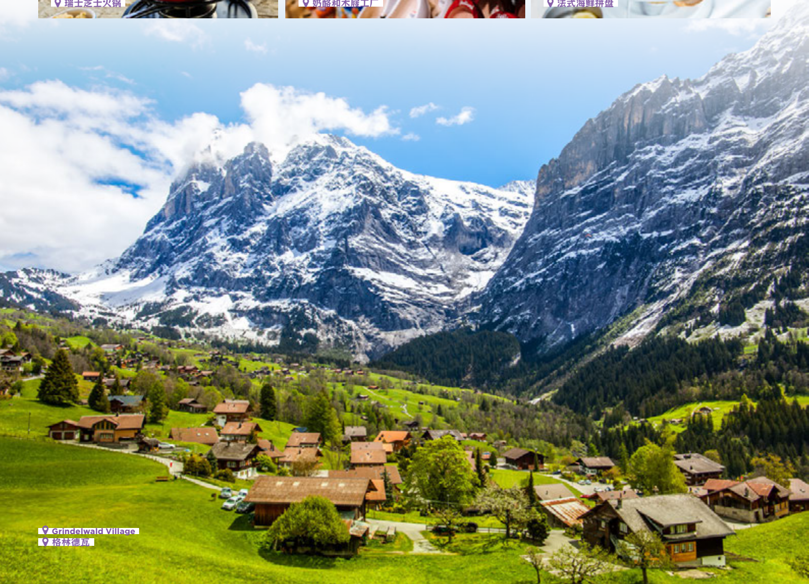
Grindelwald Village 格林德瓦