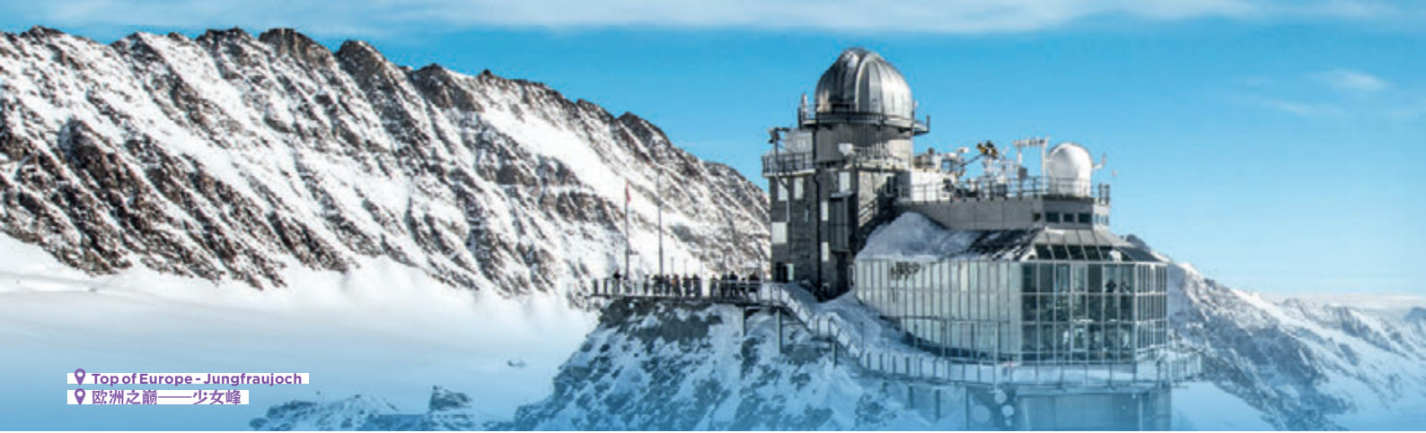
Top of Europe - Jungfrauoch 欧洲之巅——少女峰