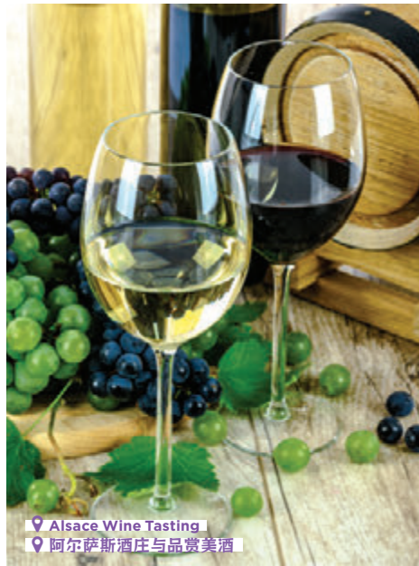
Alsace Wine Tasting 阿尔萨斯酒庄与品鉴美酒

📍 Alsace Winery Tour (France) En route to Strasbourg, unwind in the relaxed ambience of Alsace's world-renowned wine region with a winery visit complete with wine-tasting .