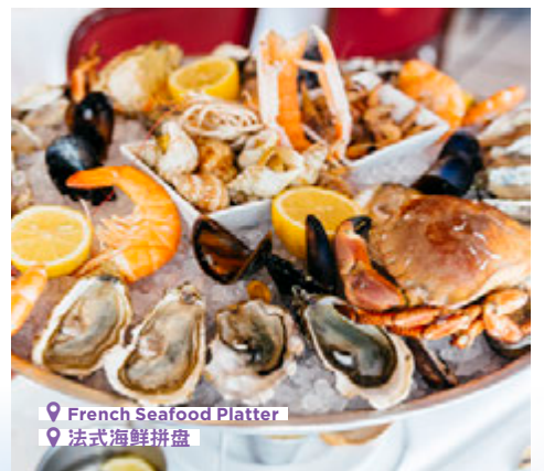
French Seafood Platter 法式海鲜拼盘