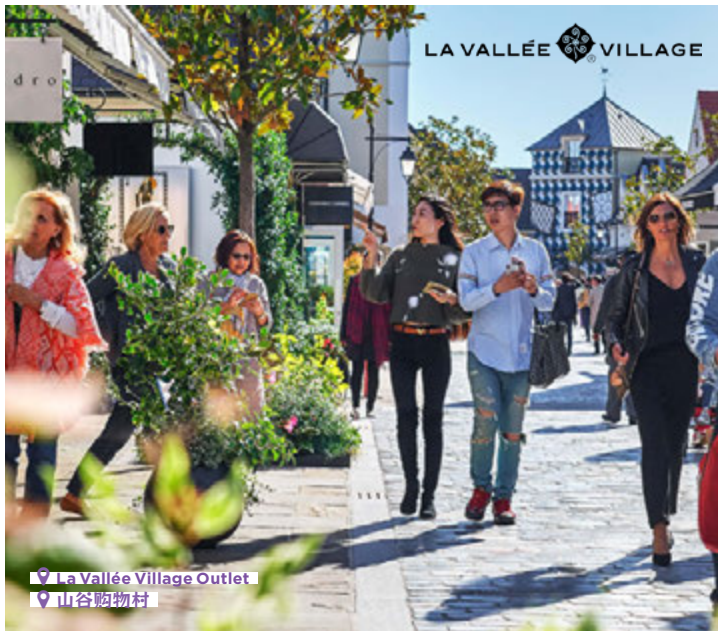
La Vallée Village Outlet 山谷购物村