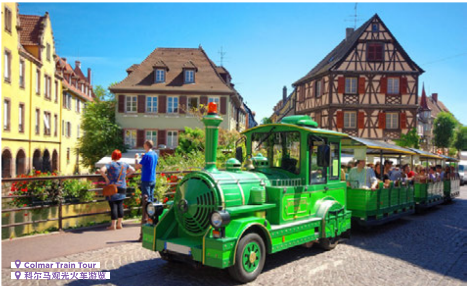
Colmar Train Tour 科尔马观光火车游览