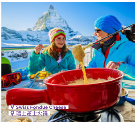
Swiss Fondue Cheese 瑞士芝士火锅