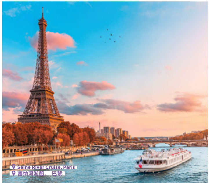
Seine River Cruise, Paris 塞纳河游船, 巴黎