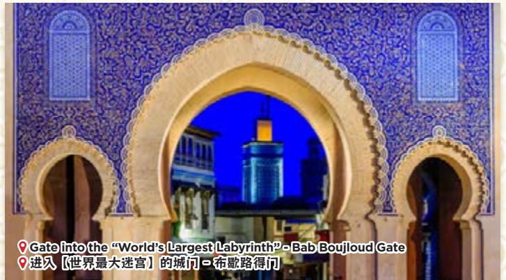
Gate into the "World's Largest Labyrinth" - Bab Boujloud Gate 进入【世界最大迷宫】的城门 - 布歇路得门