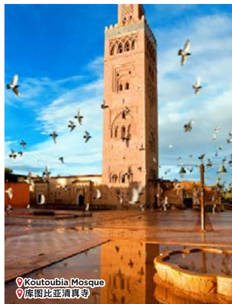
Koutoubia Mosque 库图比亚清真寺