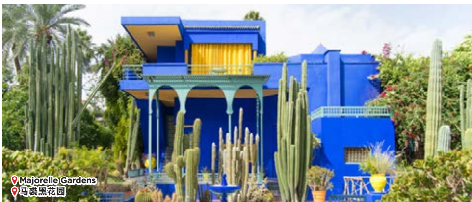
Majorelle Gardens 马裘黑花园

Proceed to Djemaa-el-Fna Square , the heart of Marrakesh, where the fortune tellers, acrobats, vendors, snake charmers and magicians put on a never-ending show.