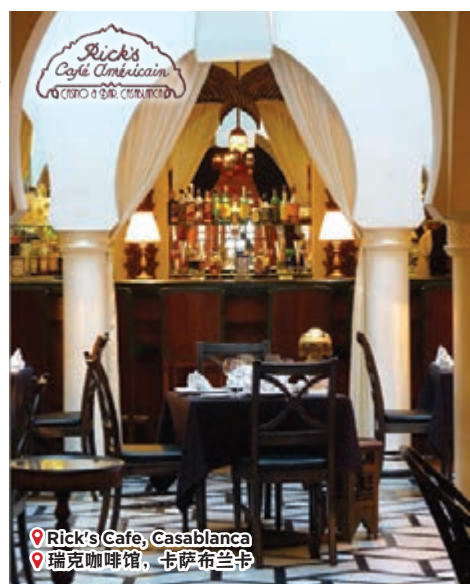
Rick's Café, Casablanca 瑞克咖啡馆, 卡萨布兰卡