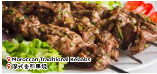
📍 Moroccan Traditional Kebabs 📍 摩式香料串烧