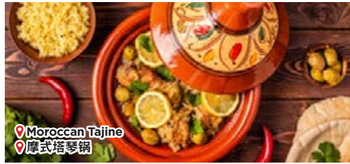
📍 Moroccan Tajine 📍 摩式塔琴锅

*餐饮与酒店会随着季节与当时情况, 作最适当的调整。*Meals & hotels above are subject to change without prior notice.