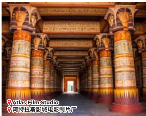
Atlas Film Studio 阿特拉斯影城电影制片厂

After that, visit the Kasbah of Taourirt nearby before travelling out to one of the largest Kasbah in Morocco, Kasbah of Ait Benhaddou , a UNESCO World Heritage Site.