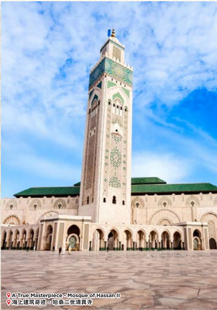
A True Masterpiece - Mosque of Hassan II 海上建筑奇迹 - 哈桑三世清真寺

摩洛哥著名的4大皇城是4座世界遗产古城，分别为拉巴特、梅克尼斯、菲斯、马拉喀什，均在历史上扮演重要的角色。这行程将让您见证其中3大皇城，用斑斓的色彩，画下摩洛哥的浪漫印象。