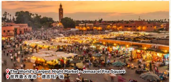
The World's Largest Night Market - Jemaa-el Fna Square 世界最大夜市 - 德吉玛广场

千年古城菲斯，旧城区呈现昔日的纯朴风光，常用驴车、马车载货交通，老灵魂仍然抖擞。