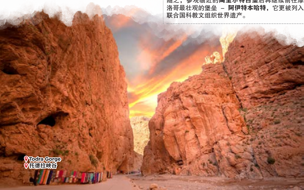
Todra Gorge 托德拉峡谷