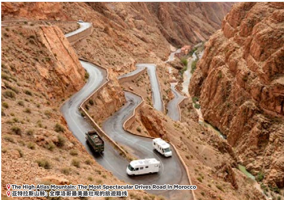
The High Atlas Mountain: The Most Spectacular Drives Road In Morocco 亚特拉斯山脉: 全摩洛哥最美最壮观的旅游路线