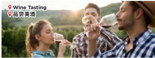
📍 Wine Tasting 📍 品尝美酒

*餐饮与酒店会随着季节与当时情况, 作最适当的调整。*Meals & hotels above are subject to change without prior notice.