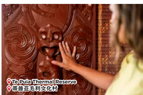
Te Puia Thermal Reserve 蒂普亚毛利文化村

Maori Hangi Feast and Performance Haere Mai ('Welcome' in Maori language)! Tonight, be braced for a most traditional welcome to the North Island of New Zealand. Enjoy the fascinating Maori cultural performance and savour the delightful Hangi feast .