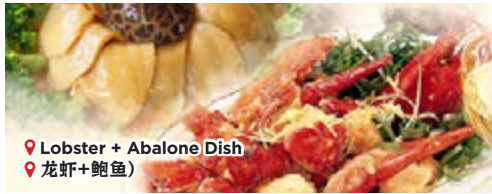
📍 Lobster + Abalone Dish 📍 龙虾+鲍鱼