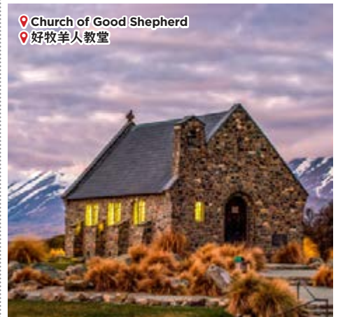
Church of Good Shepherd 好牧羊人教堂