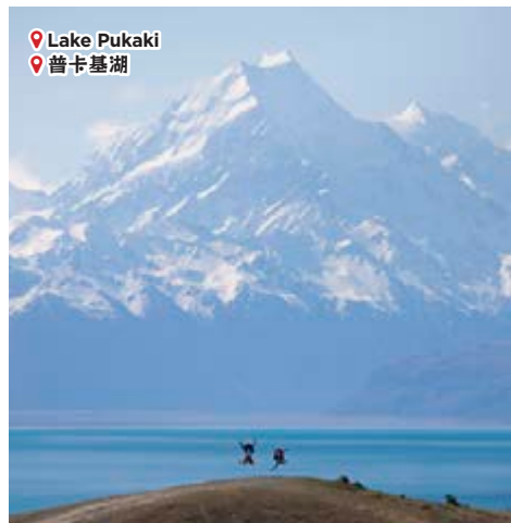
📍 Lake Pukaki 📍 普卡基湖

Note: Prices are provided by local supplier and subject to change based on currency exchange. If your order can't be fulfilled, you may request for a full refund.