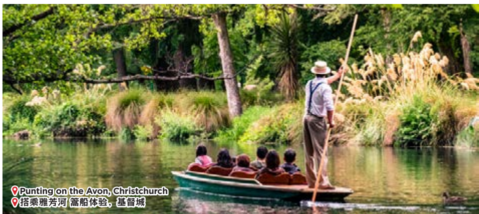
Punting on the Avon, Christchurch 搭乘雅芳河 篙船体验, 基督城

After dinner, transfer to airport for our departure flight back home.