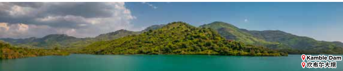
Kambale Dam 坎布尔大坝

** We have already chosen the best accommodation available in those areas of Pakistan