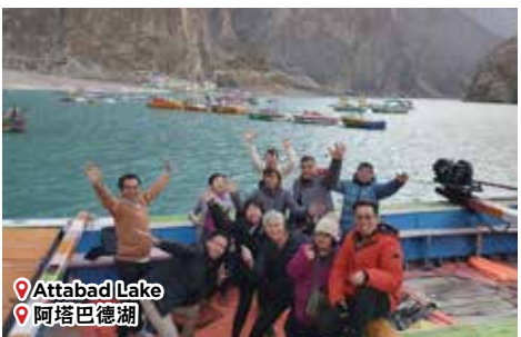
📍 Attabad Lake 📍 阿塔巴德湖

Embark on a scenic journey from Gilgit to Hunza and explore ancient petroglyphs, breathtaking viewpoints, and historical sites. Learn about the rich history and culture of the region while taking in stunning views of the mountains and rivers, stopping at Rakaposhi view point and old silk road for stunning views of the mountain. We will also visit Kargah Buddha too. The journey will end at Attabad Lake , known for its breathtaking blue-green waters. Take in stunning views of the Rakaposhi mountain , one of the highest peaks in the Karakoram range.