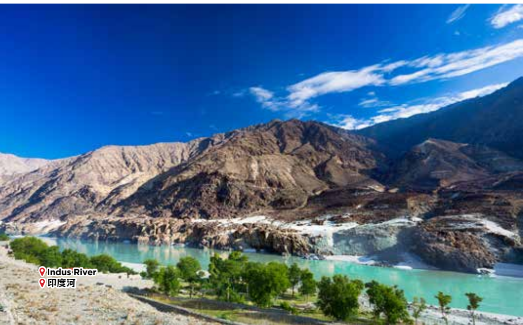
📍 Indus River 📍 印度河

*Bring warm clothing, as it can get chilly at high altitudes. Wear comfortable walking shoes. The itinerary is subject to change depending on weather and road conditions.