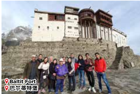
📍 Baltit Fort 📍 巴尔蒂特堡

*Travellers should be prepared for some walking during the day, especially when exploring the forts and villages.