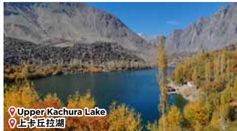
📍 Upper Kachura Lake 📍 上卡丘拉湖

Today embark on a journey to discover the stunning natural beauty and rich cultural heritage of Skardu. We will visit buddha rock, Shigar Valley and boating on Shangrila Lake you'll get a taste of everything these valleys have to offer. The itinerary also includes visits to the beautiful Apricot Gardens.