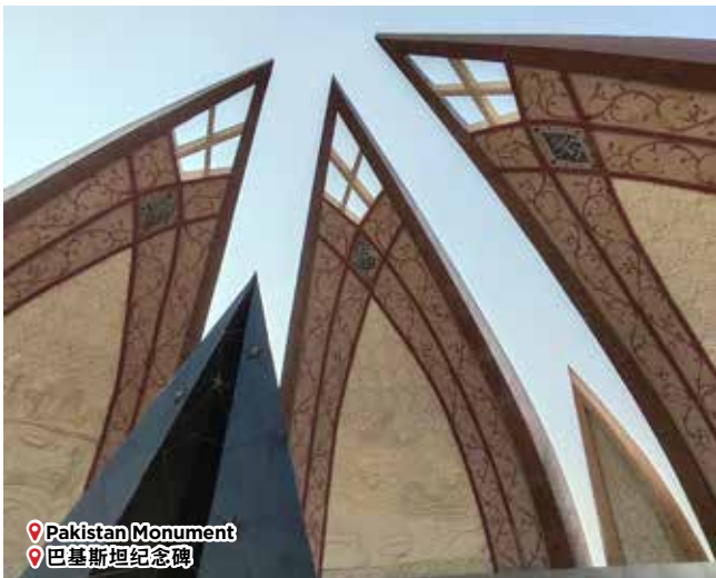
📍 Pakistan Monument 📍 巴基斯坦纪念碑