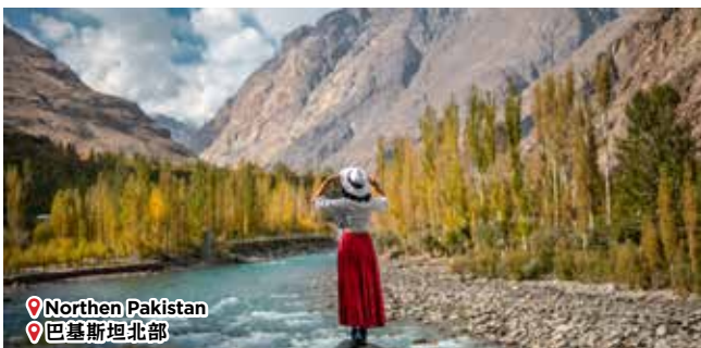
📍 Northern Pakistan 📍 巴基斯坦北部