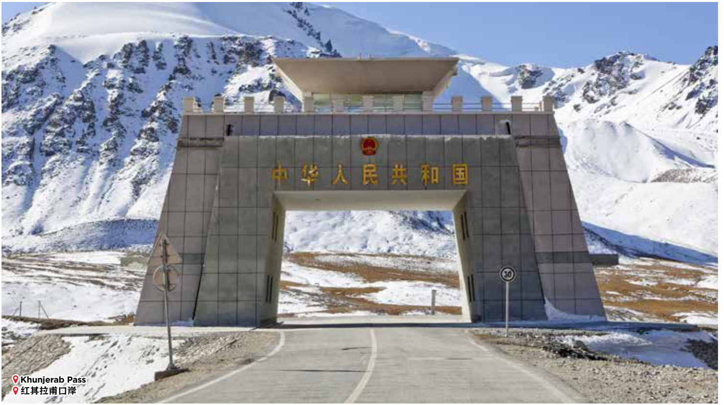
📍 Khunjerab Pass 📍 红其拉甫口岸