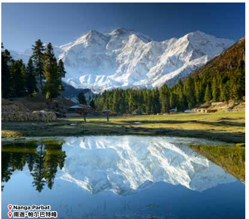
📍 Nanga Parbat 📍 南迦·帕尔巴特峰