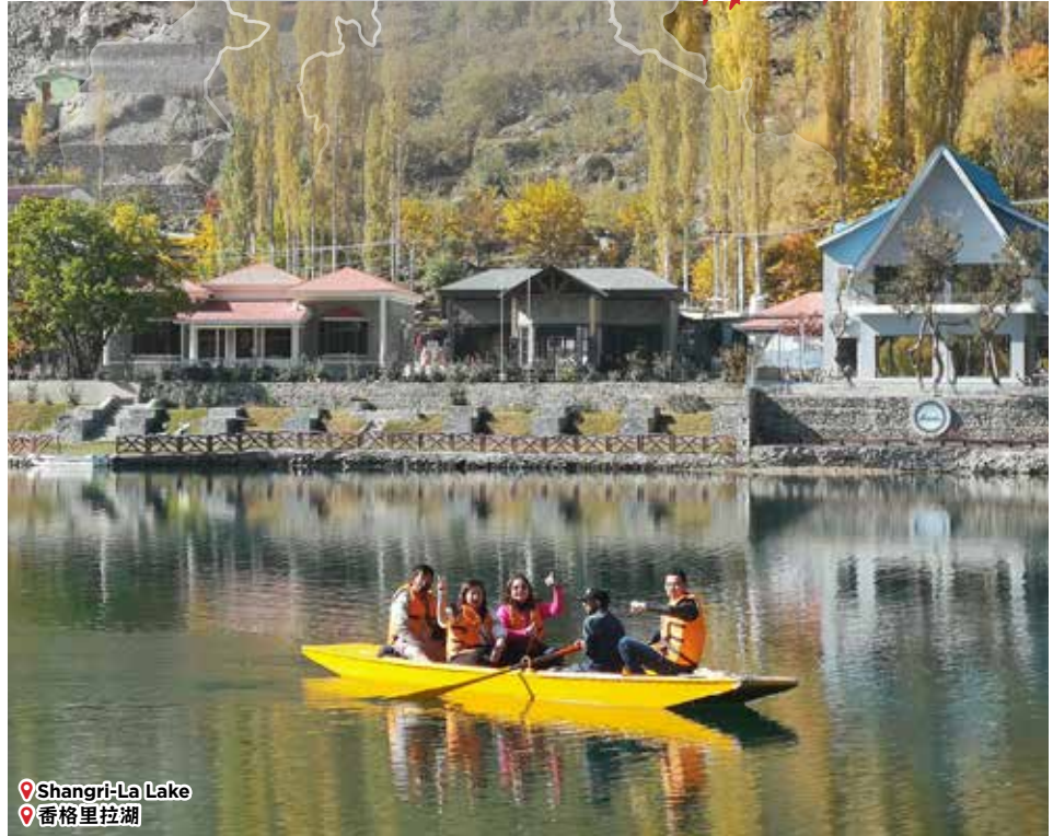
📍 Shangri-La Lake 📍 香格里拉湖