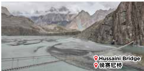
📍 Hussaini Bridge 📍 侯赛尼桥

After breakfast, boat ride at Attabad Lake and Hussaini Bridge for stunning views. Visit Gulmit village to learn about the local culture. Explore Borith Lake and hike to Passu Glacier for breathtaking views. Return to the hotel and relax while admiring the scenic views of the mountains and glaciers at Attabad Lake.