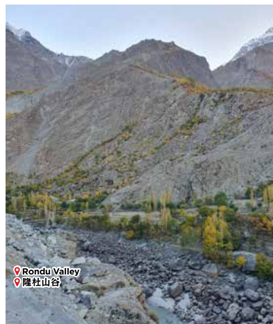
📍 Rondu Valley 📍 隆杜山谷

Enjoy a picturesque day drive from Hunza Valley to Skardu , passing through the famous Karakoram Highway and the Jaglote Skardu Road, along with the beautiful Indus River. Experience the stunning natural beauty of the region, explore the Rondu Valley and its charming villages with unique perched houses, and learn about the area's rich history.