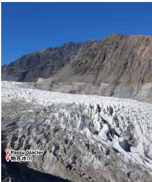
📍 Passu Glacier 📍 帕苏冰川