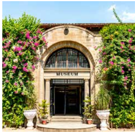
📍 Taxila Museum 📍 塔克西拉博物馆

Depart from Islamabad to Taxila . Visit Taxila Museum to see Buddhist artifacts. Explore Julian, a nearby site with ruins of a monastery. Have lunch and visit Khanpur Dam for sports activities. Drive on KKH to Naran and check into the hotel to conclude the tour.