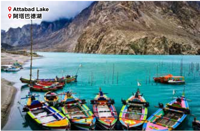
📍 Attabad Lake 📍 阿塔巴德湖