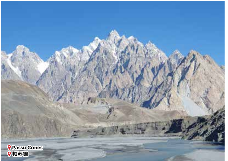
📍 Passu Cones 📍 帕苏锥