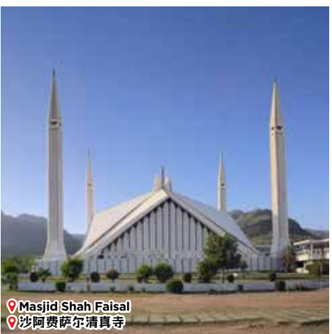
📍 Masjid Shah Faisal 📍 沙阿费萨尔清真寺