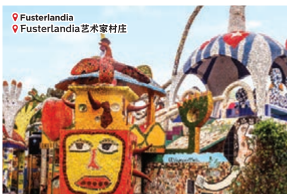
📍 Fusterlandia 📍 Fusterlandia 艺术家村庄