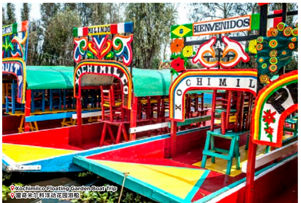
Xochimilco Floating Garden Boat Trip 霍奇米尔科浮动花园游船