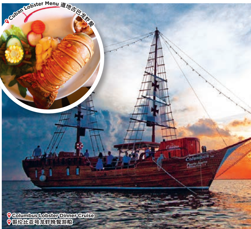
📍 Columbus Lobster Dinner Cruise 📍 哥伦比亚号龙虾晚餐游船