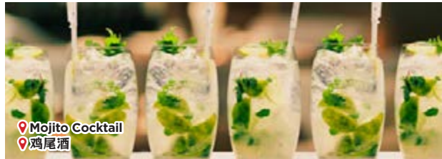
Mojito Cocktail 鸡尾酒