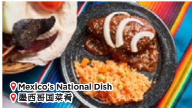
Mexico's National Dish 墨西哥国菜肴

*餐饮与酒店会随着季节与当时情况，作最适当的调整。*Meals & hotels above are subject to change without prior notice.