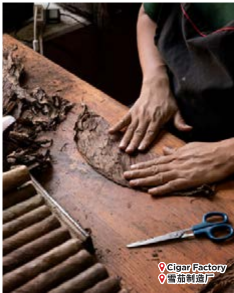
📍Cigar Factory 📍雪茄制造厂

Explore one of the oldest extant brands of Cigar Factory . Learn about Cuban cigar and get a chance to see the locals hard at work.