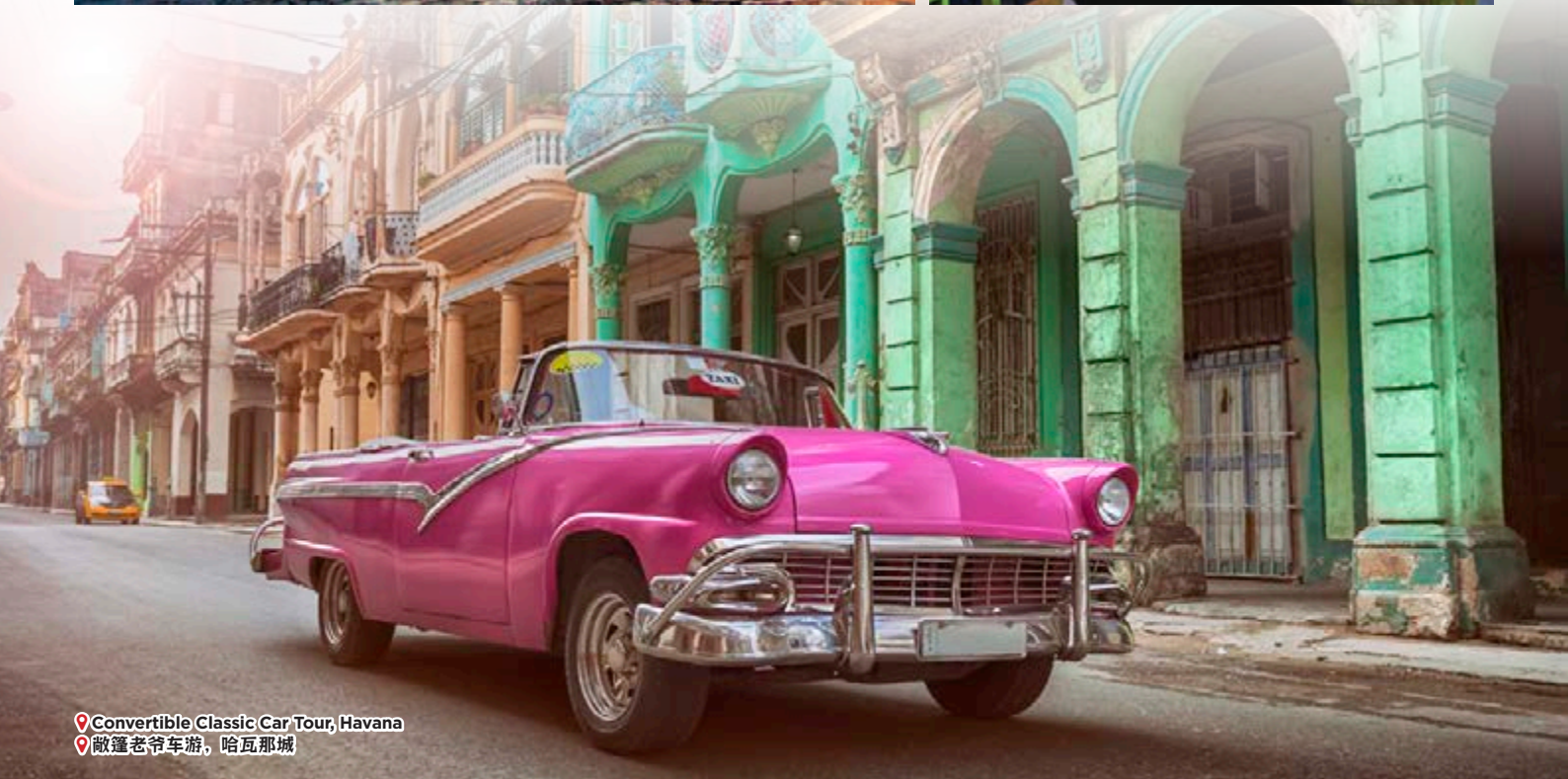
📍 Convertible Classic Car Tour, Havana 📍 敞篷老爷车游, 哈瓦那城