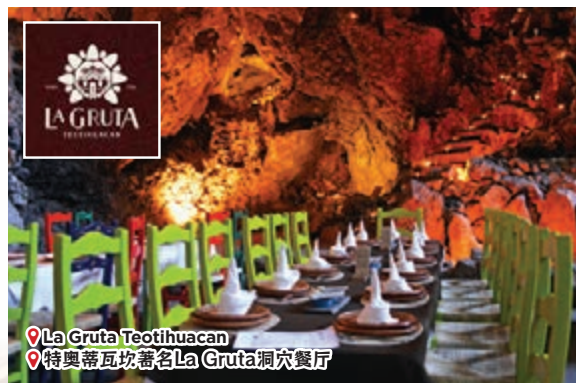
📍 La Gruta Teotihuacan 📍 特奥蒂瓦坎著名 La Gruta 洞穴餐厅