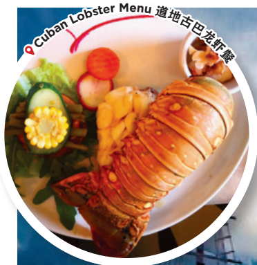
📍 Cuban Lobster Menu 道地古巴龙虾餐