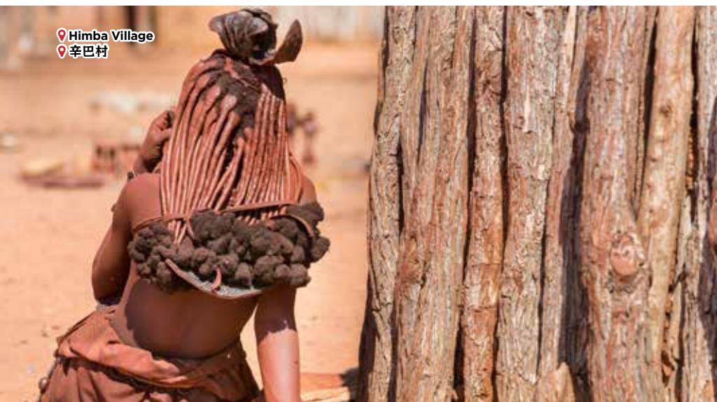
Himba Village 辛巴村

Also, give a try climbing up to the top of Dune 45 , the most photographed dune in the world. After lunch, explore the Sesriem Canyon , a deep chasm craved through the rocks by water over millions of years.