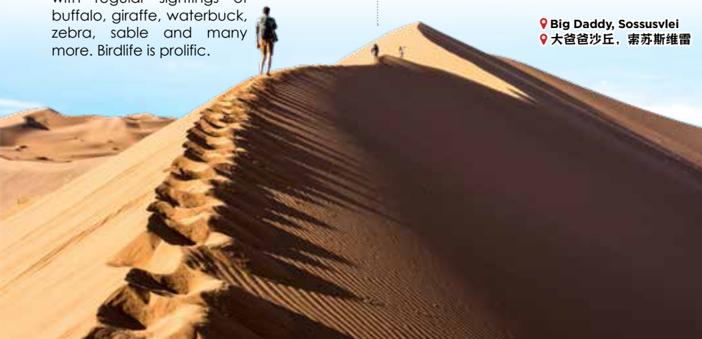
📍 Big Daddy, Sossusvlei 📍 大爸爸沙丘, 索苏斯维雷

In the morning, enjoy game drive at this marvelous private game reserve. The reserve is well stocked with a wide variety of game with regular sightings of buffalo, giraffe, waterbuck, zebra, sable and many more. Birdlife is prolific.