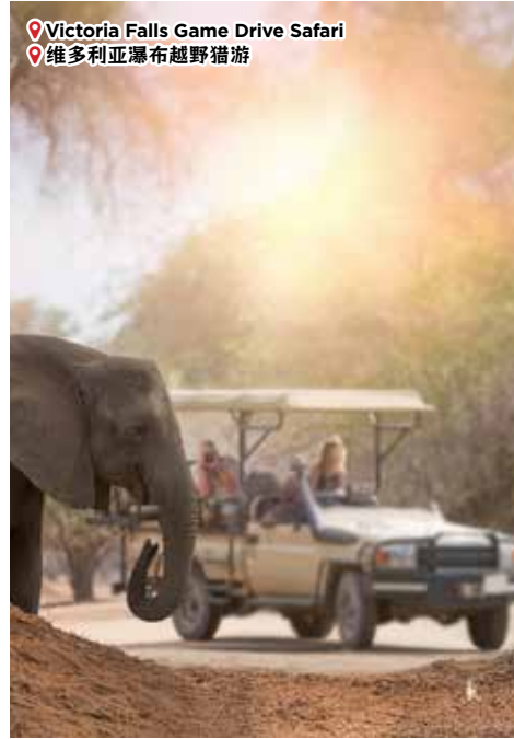
Victoria Falls Game Drive Safari 维多利亚瀑布越野猎游

Back on land, join a 4x4 dune trip to Sandwich Harbour along the beach, one of Southern Africa's richest and unique wetlands and one of five RAMSAR (Ramsar site no.743) in Namibia. Giant sand dunes run straight into the ocean, creating breathtaking sceneries and unique landscapes, just waiting to be discovered!