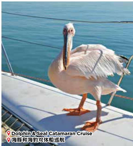
📍 Dolphin & Seal Catamaran Cruise 📍 海豚和海豹双体船巡航