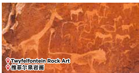
Twyfelfontein Rock Art 推菲尔泉岩画

驶过亨蒂斯湾，骷髅海岸就位于此地。这片长达500公里的海岸线被称为“上帝愤怒之地”和“地狱之门”，遍布着无数个都是由于恶劣气候而搁浅在此的沉船和鲸骨。接着，与2008年搁浅的海上捕捞船——Zelia号沉船打卡拍照。