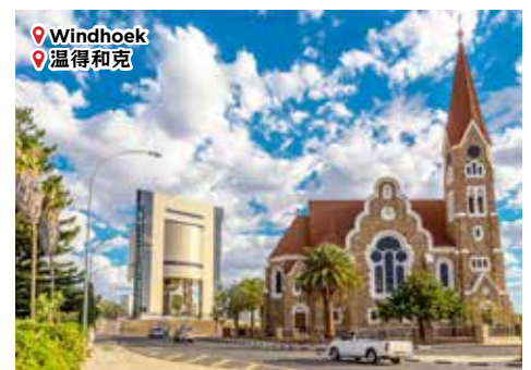
📍 Windhoek 📍 温得和克