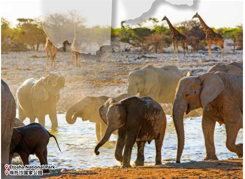
📍 Etosha National Park 📍 埃托沙国家公园