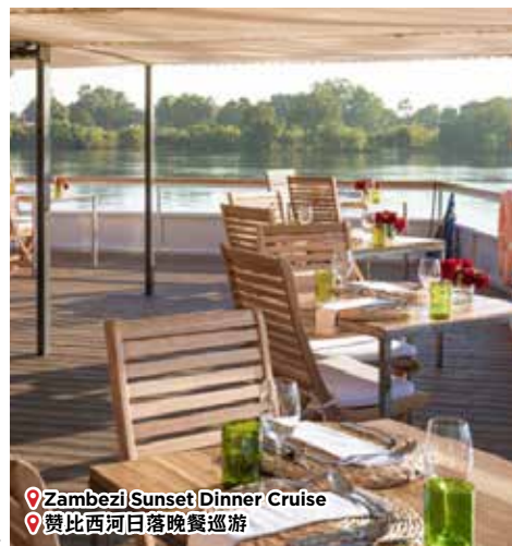
Zambezi Sunset Dinner Cruise 赞比西河日落晚餐巡游