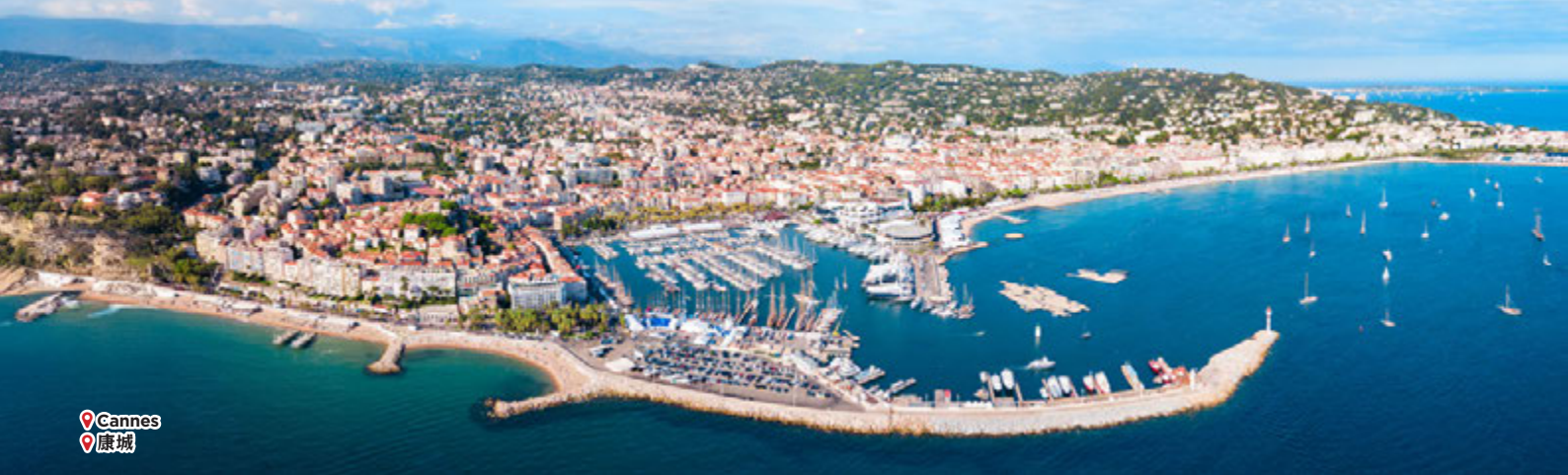
📍 Cannes 📍 康城