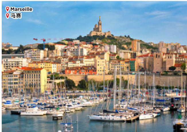
📍 Marseille 📍 马赛