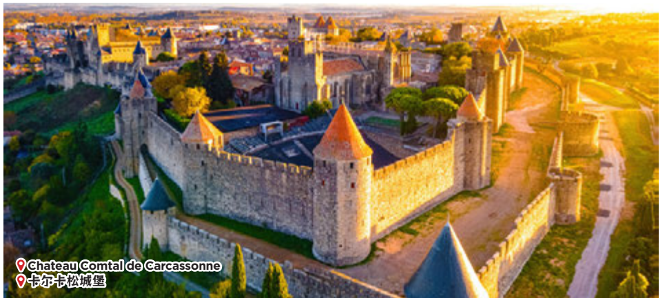
📍 Chateau Comtal de Carcassonne 📍 卡尔卡松城堡