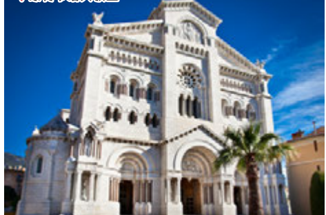
Monte Carlo Cathedral 蒙特卡洛大教堂

游览法国最古老的城市-马赛，并欣赏其重要景点—— 圣母加德大教堂 ，这座城市最高的纪念碑。在山顶上享受观赏360°的城市和岛屿全景。继续欣赏老港，以及著名的纪念碑—— 隆尚宫 。