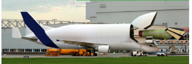
📍 Air bus Factory in Toulouse 📍 图卢兹航空空客

Visit picturesque Marseille, France's oldest city and photo-stop at the highlight of Marseille – Basilica of Notre Dame de la Garde , the highest monument of Marseille. Embrace the 360° panoramic view on the hill over the city and island. Continue to see Vieux Port , famous monument of Palais Longchamp .