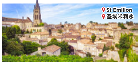
St Emilion 圣埃米利永

参观坐落在举世闻名的圣埃米利永地区的著名酒庄之一，体验且品尝被誉为世界上最优秀之一的葡萄酒。