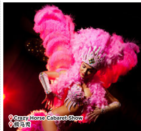
Crazy Horse Cabaret Show 疯马秀

一场由训练有素、穿着美丽服装的舞者透过一系列精心编排的动作颂扬女性气质，专注于诱惑的时尚艺术表演。（需着装优雅）