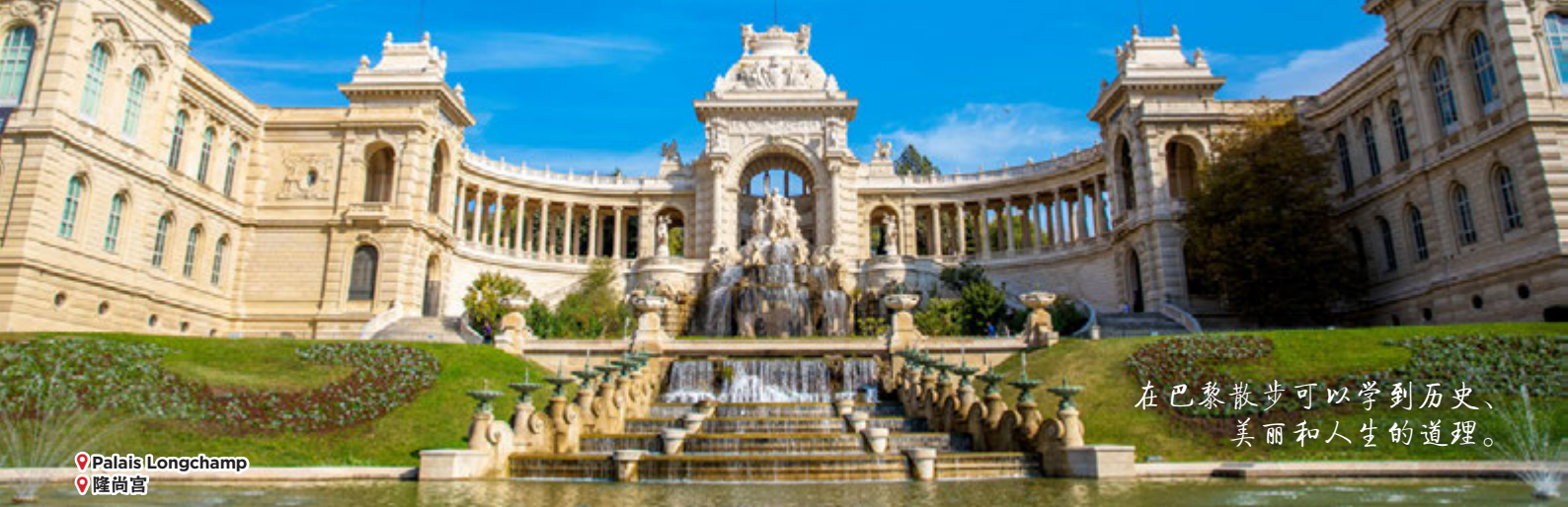
Palais Longchamp 隆尚宫