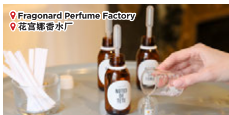
📍 Fragonard Perfume Factory 📍 花宫娜香水厂

Visit the Fragonard Perfume Factory and create your personal perfume . Take a walk through the meandering alleys of Eze Village and be rewarded with a picturesque view of the Riviera from the village, perched on a boulder high above the Cote d'Azur.