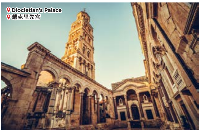
📍 Diocletian's Palace 📍 戴克里先宫