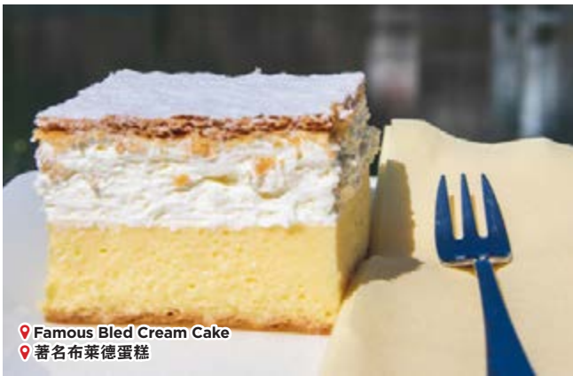
📍 Famous Bled Cream Cake 📍 著名布莱德蛋糕