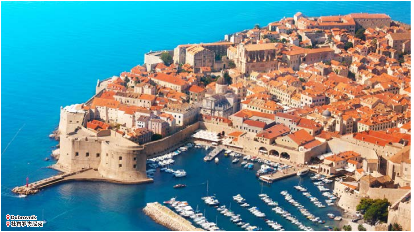
📍 Dubrovnik 📍 杜布罗夫尼克