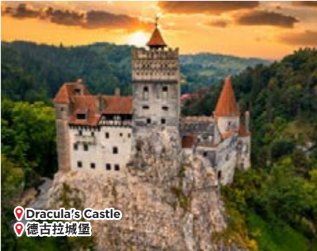
📍 Dracula's Castle 📍 德古拉城堡

Tour the medieval castle made world-famous by author Bram Stoker when he created the legendary fictional vampire, Dracula. The castle is called Dracula's Castle due to it once being inhabited by Count Dracula's infamous son Vlad III, aka Vlad the Impaler.