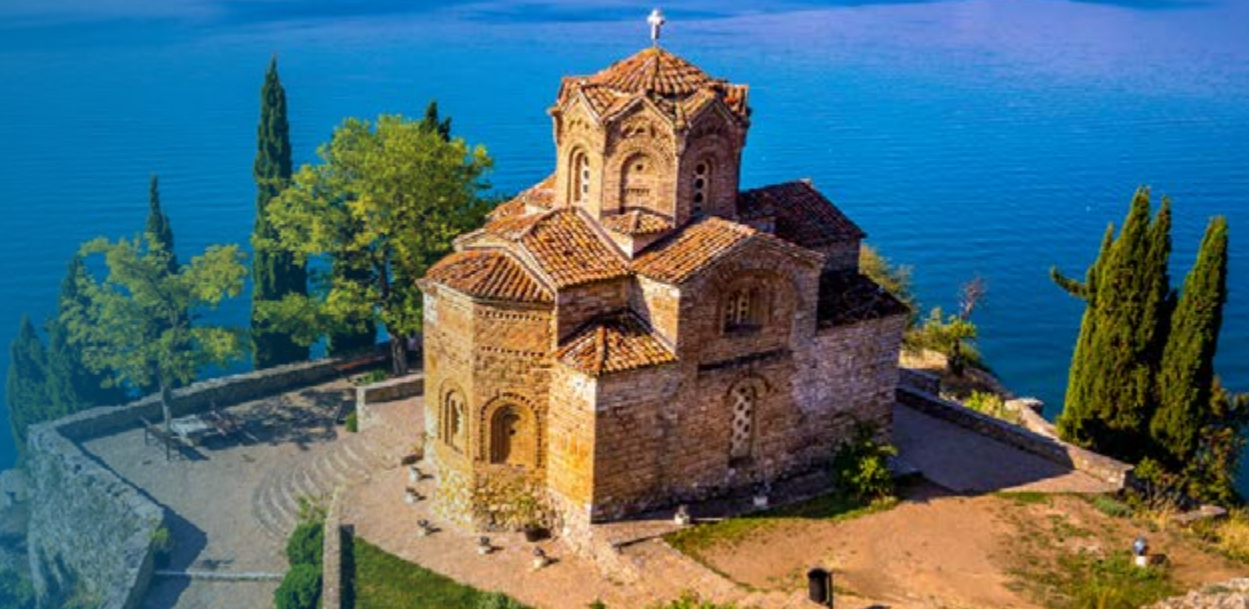
St. John of Kaneo Church 圣约翰教堂