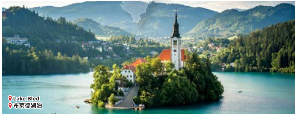
📍 Lake Bled 📍 布莱德湖泊

Called the "Macedonian Jerusalem", this UNESCO World Heritage city has numerous impressive houses of faith. Start at the Church of St. Sophia before continuing on to St. Panteleimon Monastery , which was built by St. Clement. Here, the Tomb of St. Clement was built by his very own hands and he remains buried in it to this very day. Next, head down to the photogenic St. John of Kaneo Church , built atop a cliff above the crisp, clear Lake Ohrid .