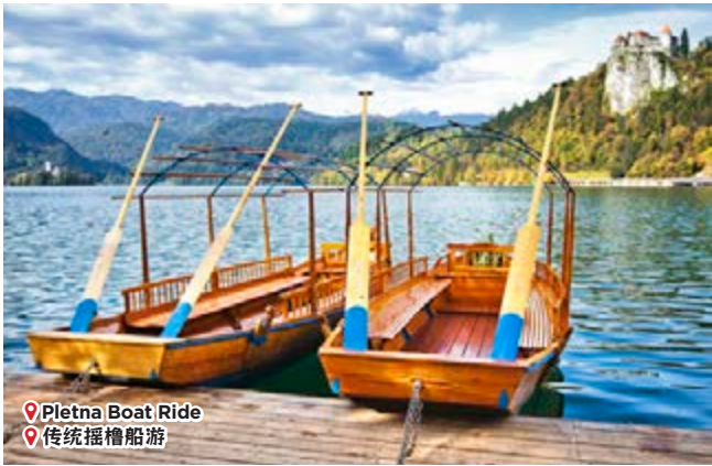
📍 Pletna Boat Ride 📍 传统摇橹船游