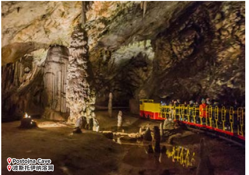
📍 Postojna Cave 📍 波斯托伊纳溶洞