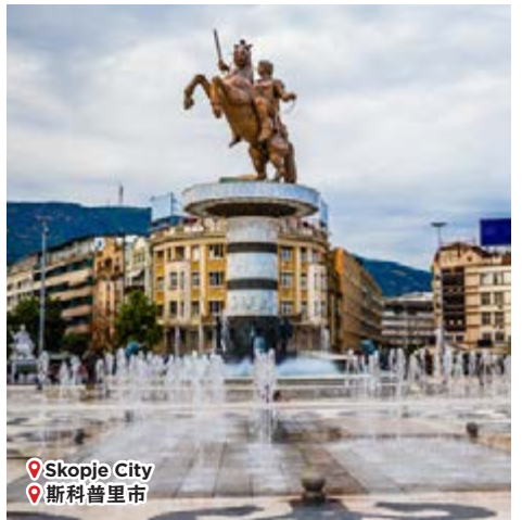
📍 Skopje City 📍 斯科普里市

Head to the Rila Mountains to visit its proud UNESCO World Heritage at Rila Monastery . View the impressive collection of wall and ceiling frescoes at the Birth of the Holy Virgin Mary Church, which is completely surrounded by the monastery with a courtyard in between. The striped design of the whole complex is a sight to behold.