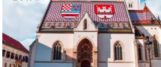
📍 St. Mark's Church 📍 圣马可教堂