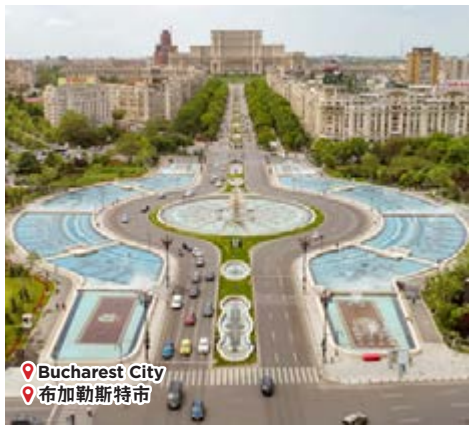
📍 Bucharest City 📍 布加勒斯特市

Drive past landmarks like the Romanian Athenaeum , the National Military Club and the Triumphal Arch . In the evening, stroll down the pedestrian old town or browse the main shopping street, Calea Victoriei .