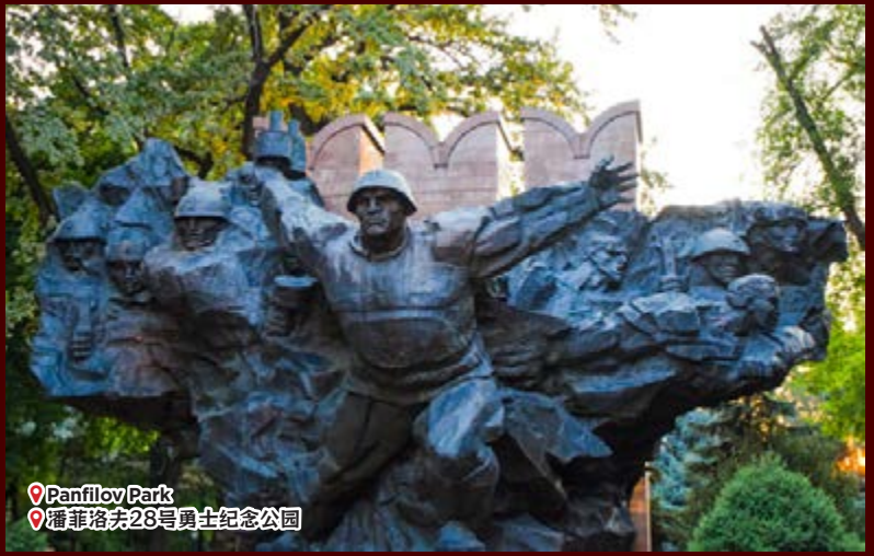
📍 Panfilov Park 📍 潘菲洛夫28号勇士纪念公园