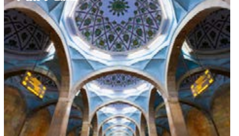
📍 Tashkent Subway 📍 塔什干地铁游

Visit the outstanding Registan Square , a complex of three fascinating Madrasahs built in the 15-17th century. Architectural complex of Shakh-i-Zindeh represents a big collection of mausoleums and a UNESCO World Heritage Site. Bibi Khanum Mosque was built in honor of Tamerlane's favorite wife, after his successful campaign in India. End the day with a Cultural and Dancing show , the 'Uzbek Bride' while dining in a traditional Uzbek house.