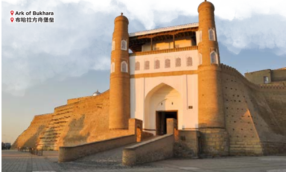
Ark of Bukhara 布哈拉方舟堡垒

Lastly, visit Ashgabat Horse Hippodrome to see the famous Turkmen Akhal-Teke horses which are believed to be the first tamed horse breed in the world. These horses have been renowned as cavalry mounts and racehorses for some 3,000 years.