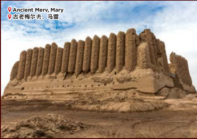
📍 Ancient Merv, Mary 📍 古老梅尔夫，马雷