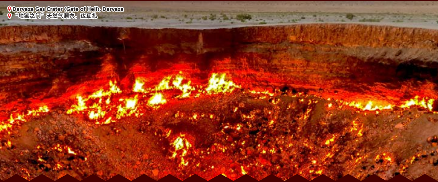
📍 Darvaza Gas Crater (Gate of Hell), Darvaza 📍 “地狱之门”天然气洞穴，达瓦扎