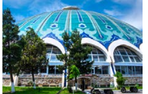
📍 Chorsu Bazaar 📍 百年贸易乔尔苏集市

Stroll around the symbol of the city, the main square of Tashkent, Independence Square where the festivities are held and in the middle of Amir Timur Square is the monument of the military leader Amir Timur. Next, photo stop at the medieval Kukeldash Madrasah and the hundred years central market under a bluedomed building, Chorsu Bazaar . Lastly, Hast Imam Complex is a religious centre that consists of several architecture monuments of madrasahs, mosques, and mausoleums. Then, explore the glorious Tashkent Subways built after the 1966 earthquake in Tashkent.