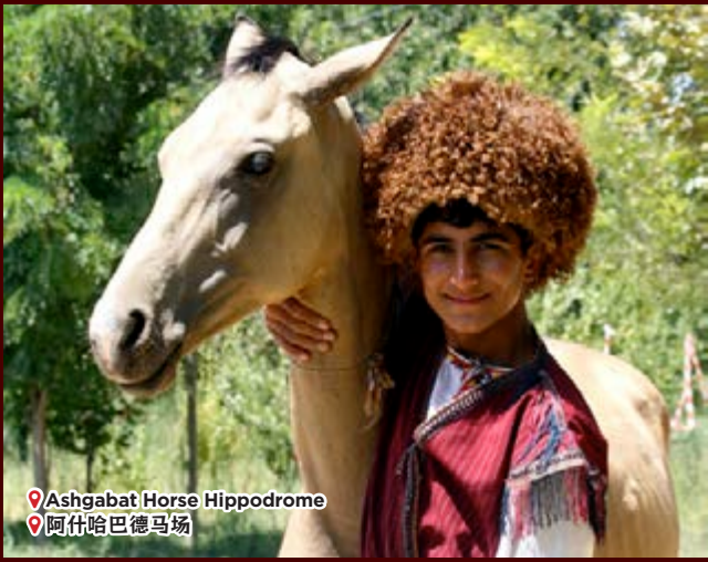
📍 Ashgabat Horse Hippodrome 📍 阿什哈巴德马场