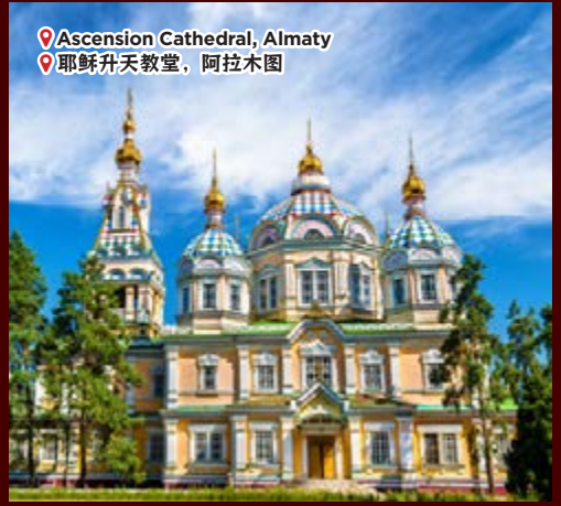
📍 Ascension Cathedral, Almaty 📍 耶稣升天教堂，阿拉木图