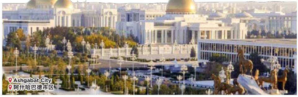
Ashgabat City 阿什哈巴德市区

Enjoy a full day of sightseeing tour starting off with the most ancient citadel in Bukhara, Ark of Bukhara , a massive fortress built and occupied from the 5th century but was bombed by the Red Army in 1920 and left a large part in ruins. Next, visit one of the major squares, Lyab-I Hauz surrounded by the artificial ponds and the famous Nadir Divan-begi Madrasah stands on the east run as a caravanserai at began. Stroll around the majestic architectural complex Poi Kalyan , consists of the 3 extraordinary structures built in the 12th to 16th centuries.