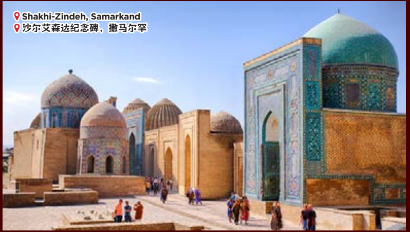
📍 Shakh-i-Zindeh, Samarkand 📍 沙尔艾森达纪念碑，撒马尔罕