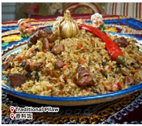
Traditional Pilaw 香料饭

Hotel Breakfast / Local Lunch / Local Dinner Darvaza Tour Take 4x4 head to the middle of the Karakum desert to discover the most unique Darvaza Gas Crater , known as "The Gates to Hell". It was created by mistake and burning non-stop since 1971. Enjoy your BBQ dinner near the burning gas crater before sunset and stunned by the other face of the crater during nighttime.