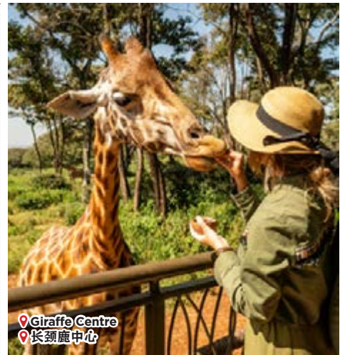
📍 Giraffe Centre 📍 长颈鹿中心

After lunch, check in to the lodge, free at own leisure and enjoy the lodge facilities. Discover this sublime resort which is not only home to our residence giraffe, waterbuck and both Vervet and Colobus monkeys, but it is also a night stop for the hippos too.