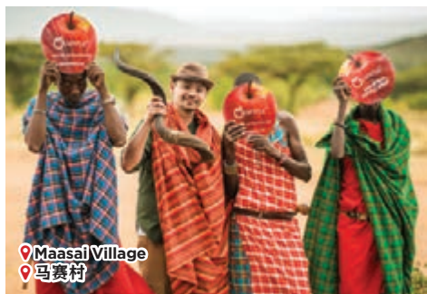
📍 Maasai Village 📍 马赛村

Upon arrival, transfer to the Tented Camp in Maasai Mara National Reserve. Enjoy your dinner and spend the rest of the night at the camp which sits on the pre-historical land of 25 million years.