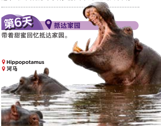
☑ Hippopotamus ☑ 河马