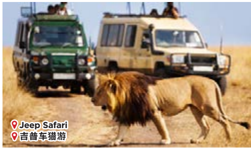
📍 Jeep Safari 📍 吉普车猎游