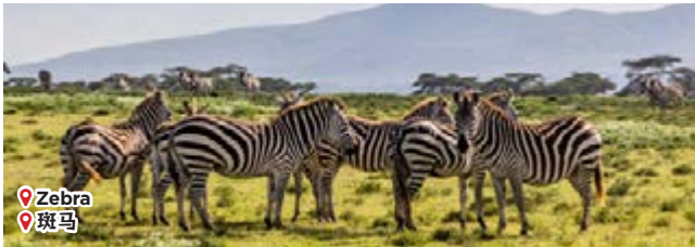
📍 Zebra 📍 斑马

*Meals & hotels above are subject to change without prior notice.