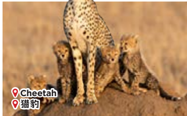
📍 Cheetah 📍 猎豹