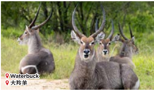
📍 Waterbuck 📍 大羚羊