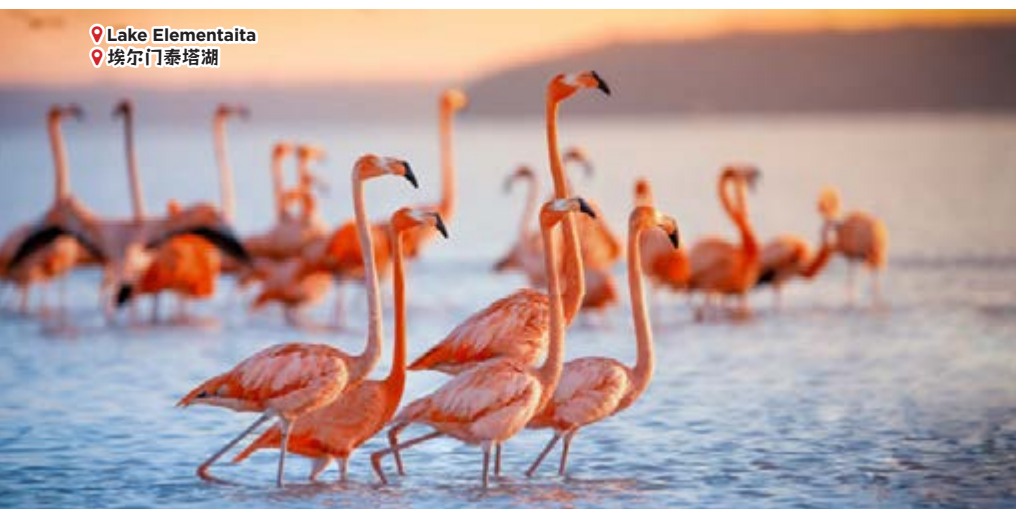
📍 Lake Elementaita 📍 埃尔蒙泰塔湖