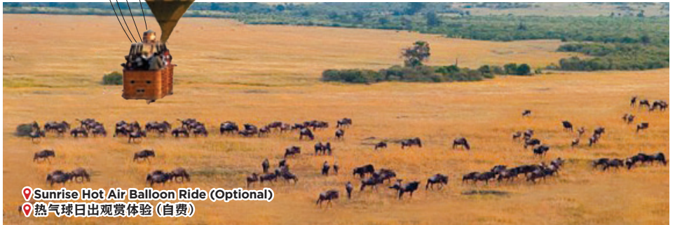
☑ Sunrise Hot Air Balloon Ride (Optional) ☑ 热气球日出观赏体验 (自费)

抵达时，前往到 豪华帐篷营地 位于 马赛马拉国家动物保护区 ，闻名于观看 角马大迁徙 猎游。今晚，享用您的晚餐与住宿一晚