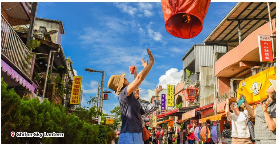
📍 Shifen Sky Lantern