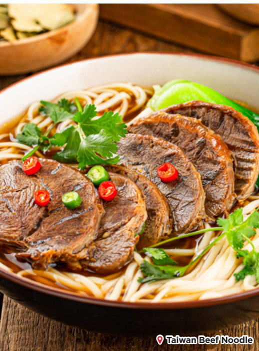
Taiwan Beef Noodle

*Meals & hotels above are subject to change without prior notice.