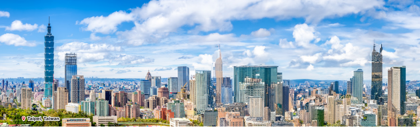
📍 Taipei, Taiwan