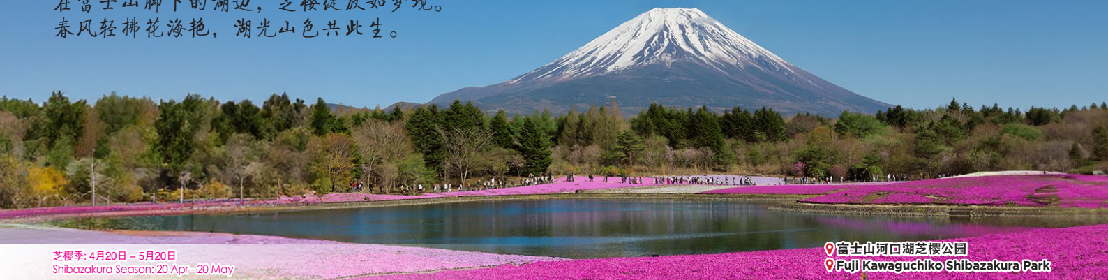
芝樱季: 4月20日 - 5月20日 Shibazakura Season: 20 Apr - 20 May