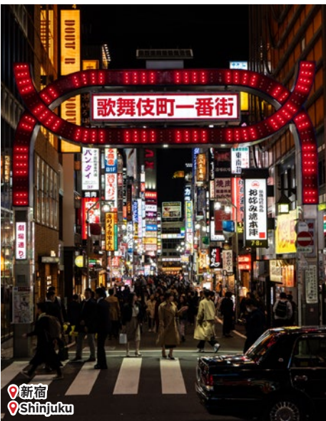
📍 新宿 📍 Shinjuku

Visit the famous and popular park for cherry blossom festival.