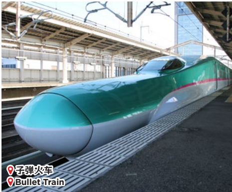
📍 子弹火车 📍 Bullet Train