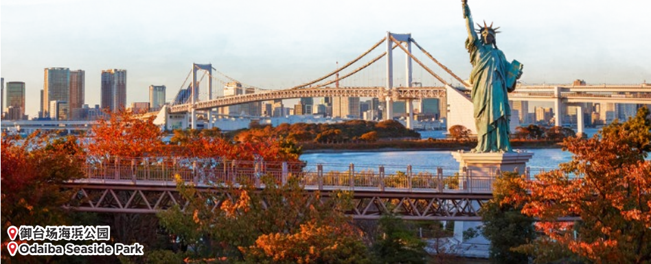
御台场海滨公园 Odaiba Seaside Park