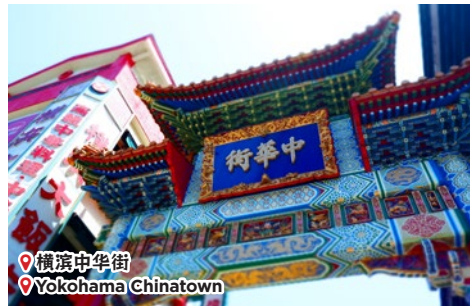
横滨中华街 Yokohama Chinatown