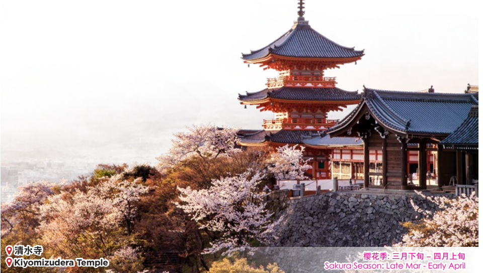
📍 清水寺 📍 Kiyomizudera Temple

Enjoy splendid views of pink Shibazakura carpeting the earth with Mt. Fuji in the background.