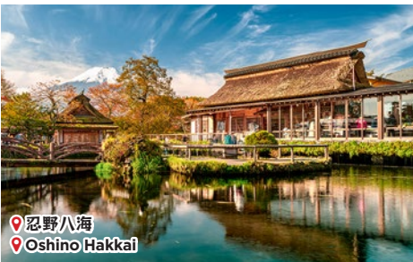
忍野八海 Oshino Hakkai

富士山河口湖芝樱公园 (4月20日 - 5月20日) 🌸 春季时分，一整片渐层的“粉红色地毯”和富士山的景色，美不胜收。