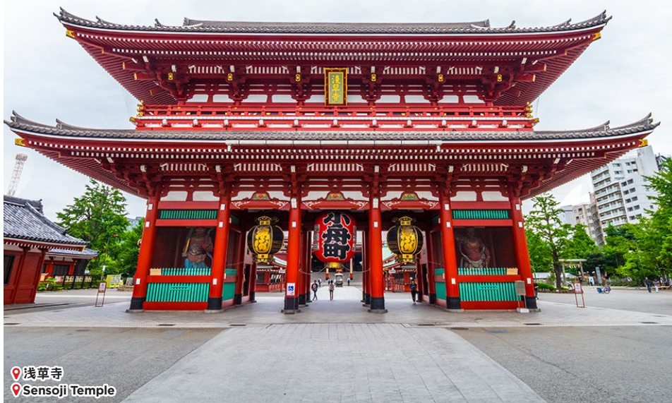
浅草寺 Sensoji Temple