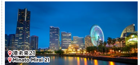
📍 港未來21 📍 Minato Mirai 21

Proceed to airport for your flight back home.