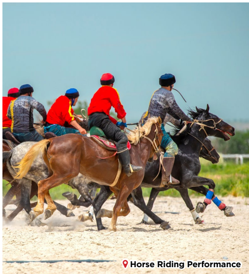
Horse Riding Performance