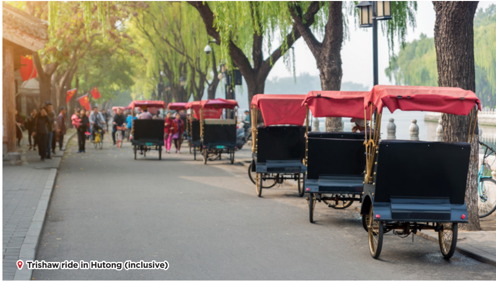
📍 Trishaw ride in Hutong (inclusive)

*Meals & hotels above are subject to change without prior notice.