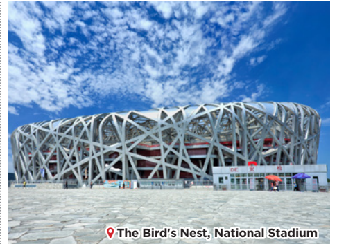
📍 The Bird's Nest, National Stadium

*Group arrive in October will be arrange for day time visit due to the early darkening of winter weather and overlook the Simatai Great Wall night scene.