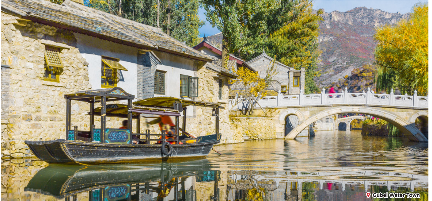
📍 Gubei Water Town