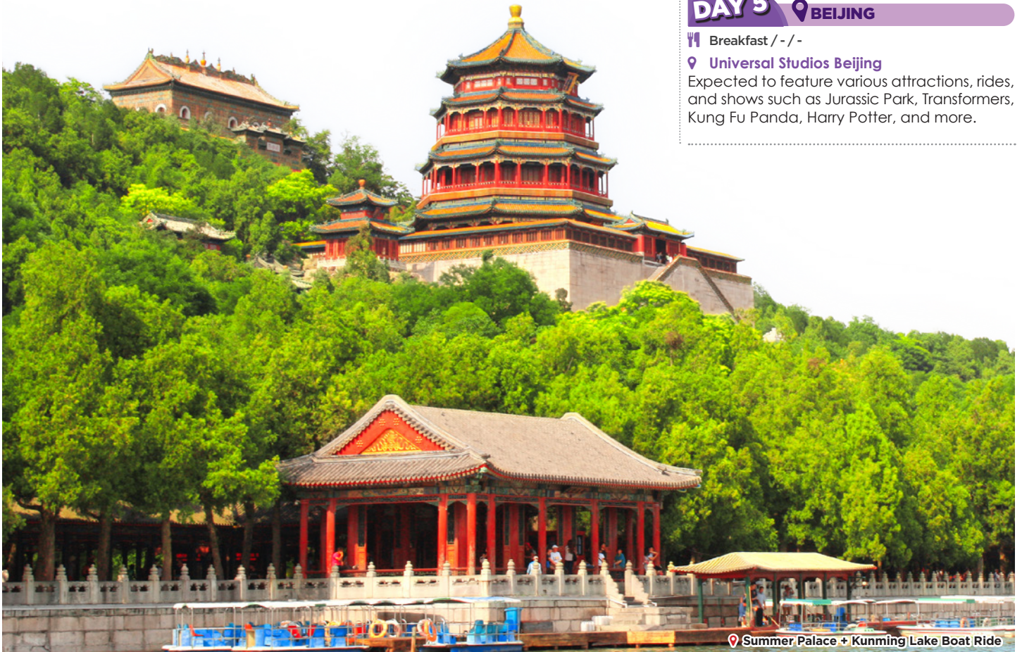
📍 Summer Palace + Kunming Lake Boat Ride

Expected to feature various attractions, rides, and shows such as Jurassic Park, Transformers, Kung Fu Panda, Harry Potter, and more.