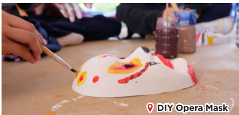
📍 DIY Opera Mask

Transfer to airport for flight back home.