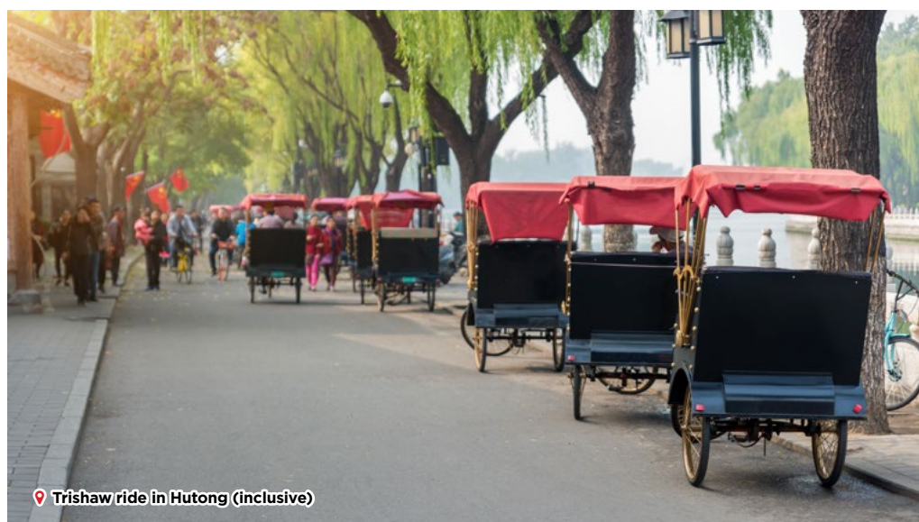
📍 Trishaw ride in Hutong (inclusive)

*Meals & hotels above are subject to change without prior notice.