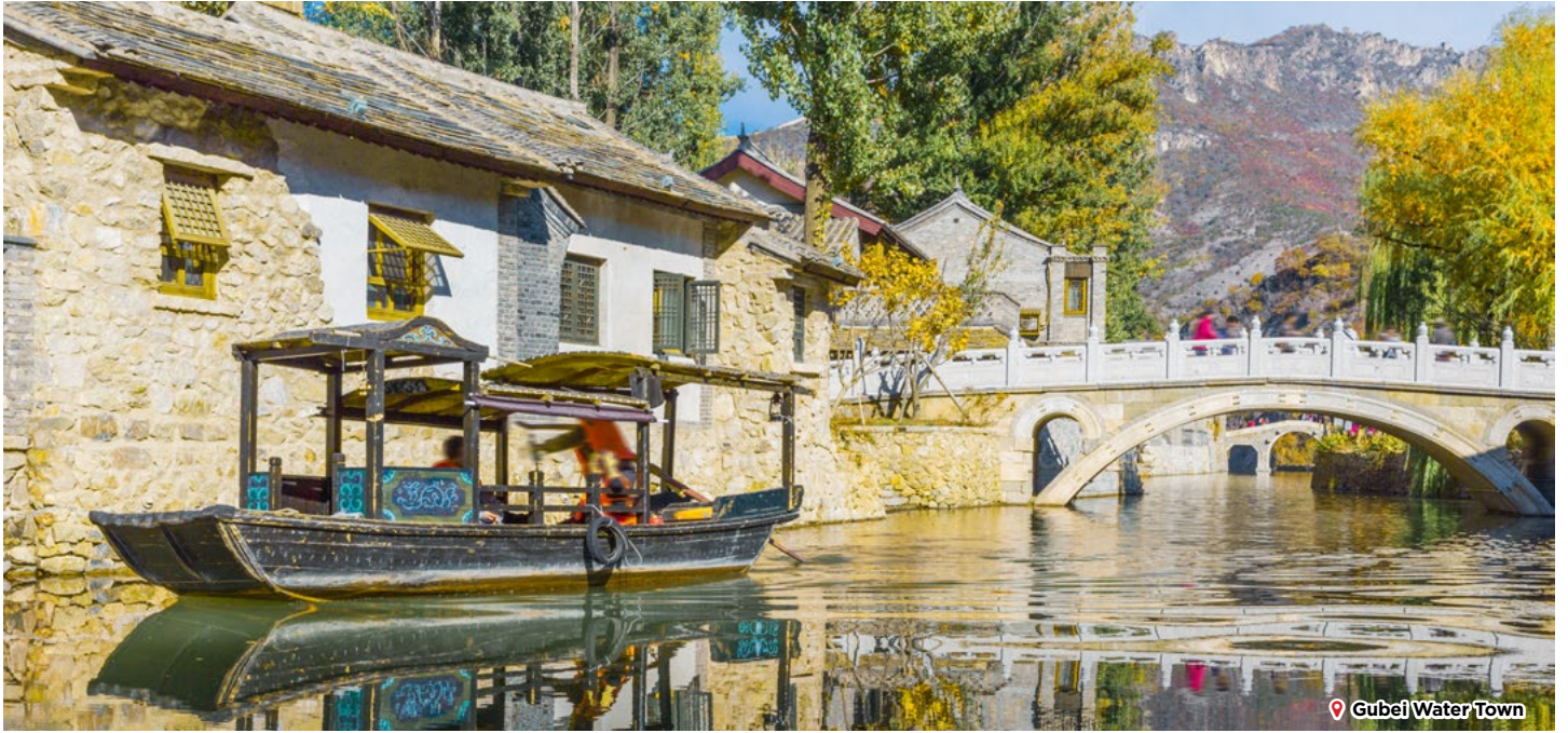
📍 Gubei Water Town