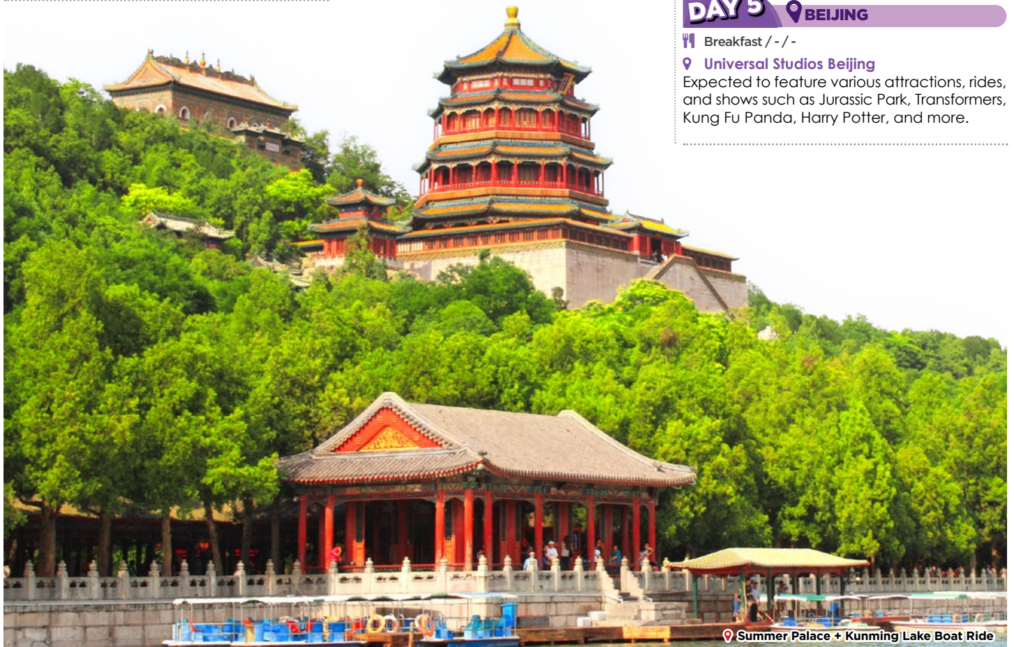
📍 Summer Palace + Kunming Lake Boat Ride

Expected to feature various attractions, rides, and shows such as Jurassic Park, Transformers, Kung Fu Panda, Harry Potter, and more.