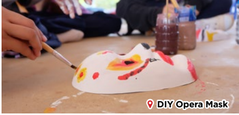
📍 DIY Opera Mask

Transfer to airport for flight back home.