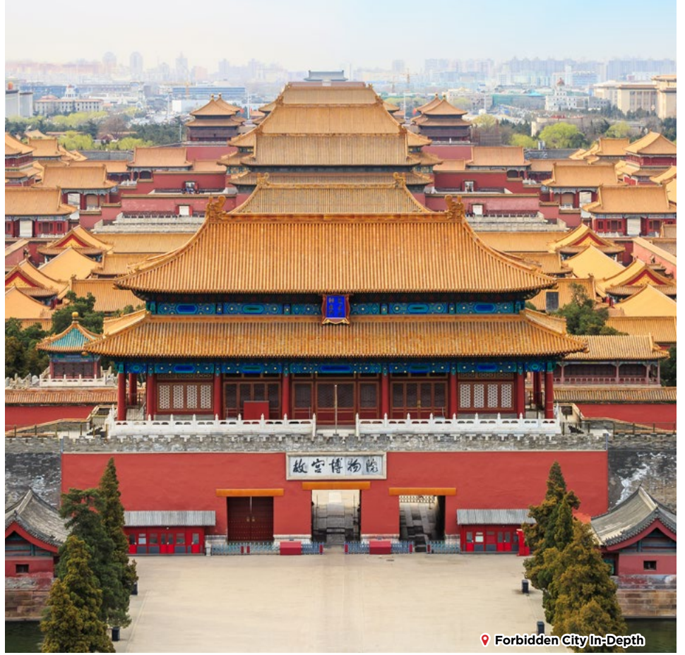
📍 Forbidden City In-Depth