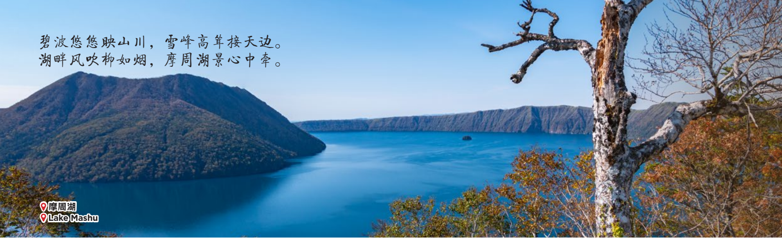
摩周湖 Lake Mashu