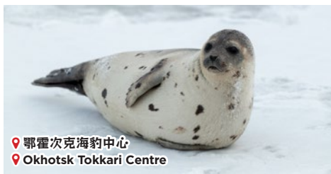
鄂霍次克海豹中心 Okhotsk Tokkari Centre