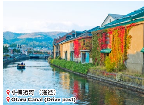
小樽运河 (途径) Otaru Canal (Drive past)