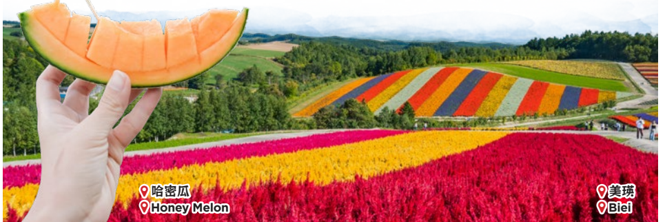
哈密瓜 Honey Melon