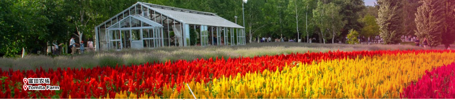
富田农场 Tomita Farm