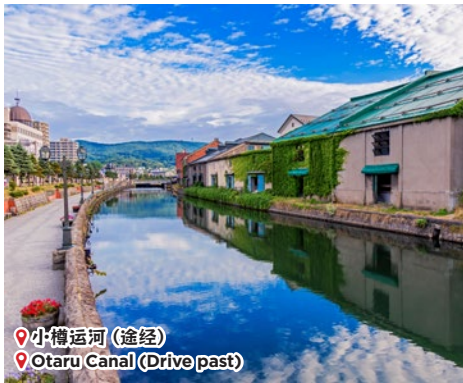
小樽运河 (途经) Otaru Canal (Drive past)