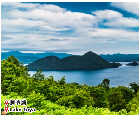
洞爷湖 Lake Tōya