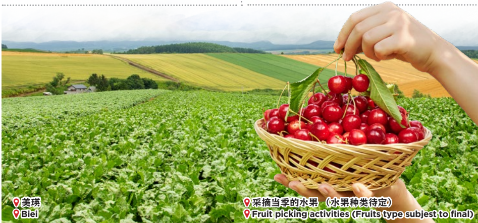
📍 美瑛 Biei

Proceed to airport for your flight back home.