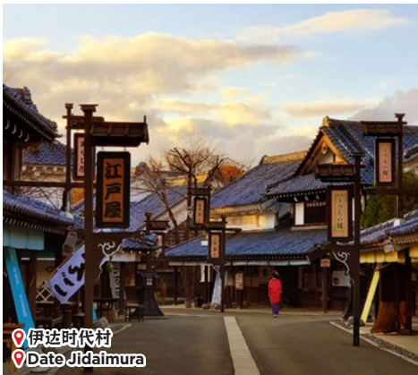
伊达时代村 Date Jidaimura